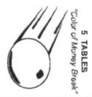
"Cue of Money Break"