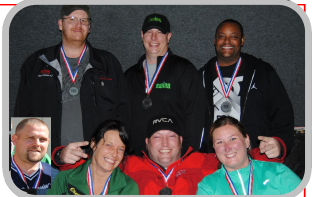
SILVER -- BALLS -N- HAND