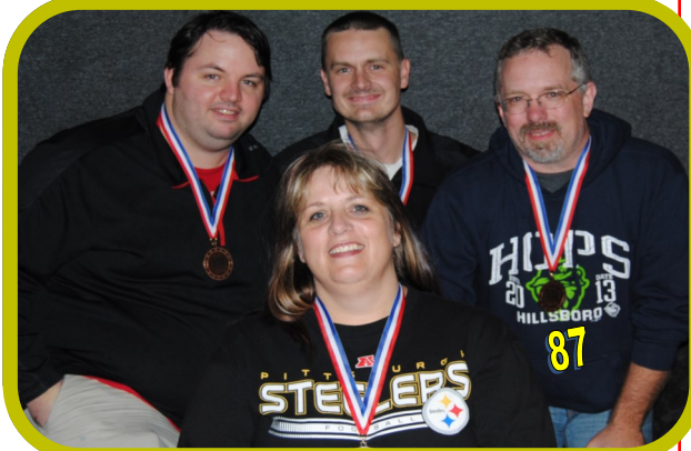
BRONZE -- SERIOUSLY ?!?!?