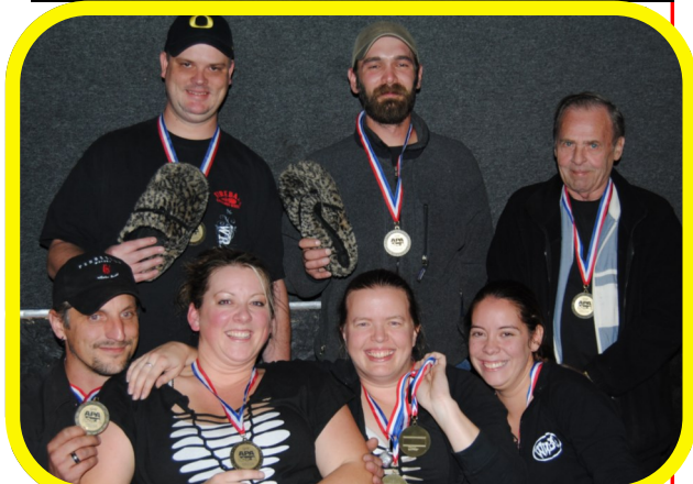
GOLD -- BODY ENGLISH