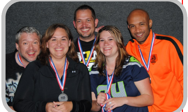
SILVER -- SPICY PICKLED TACOS