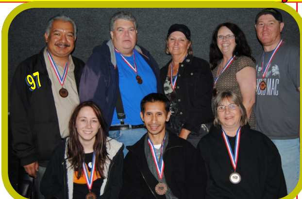
BRONZE -- POOL HUSTLERS

"Body English's" journey to the finals could not have been a longer journey They started out at the Rodders on Friday Night and ended up being slammed to the loser's side by " The Danger Zone ." Fortunately they drew a "bye" and didn't have to come in and play until the 1 PM against Pub 181's " The Pub Crawlers ." When the dust settled the Pub Crawlers went crawling home, while the "Body English" contorted themselves into the next round. In the 5 o'clock round " Body English ." came up against another Pub 181 team—"Secret Society." After that match it was no secret any longer—they too were out the door crawling after the other pub 181 team. Next, it off to get a night's sleep before Sunday's 9:00 AM Morning Medal round where they would face Sam's " Sofa Kings " It was a tough match for both teams as it came right down to the wire, but "the (Continued on Page 3.)