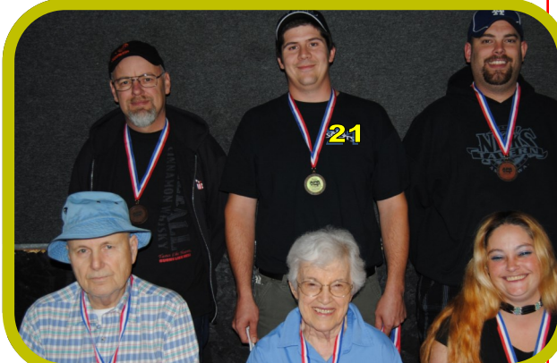
BRONZE -- RED FIR