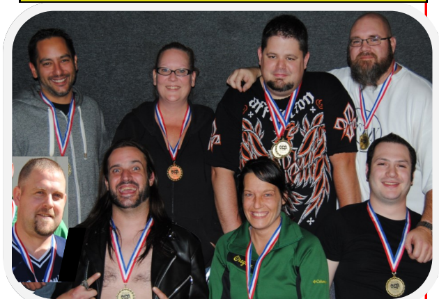
PLATINUM -- OFF IN CHURCH