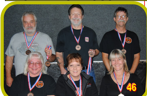
BRONZE -- STICKLERZ