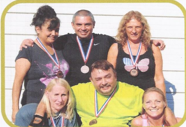
BRONZE -- RACK 'EM UP