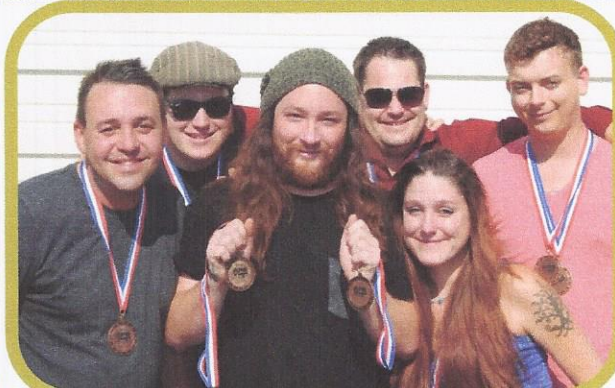
BRONZE -- SUMMER IS COMING