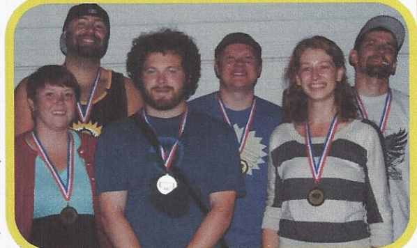
GOLD - A ROAST BEEF SAMMICH