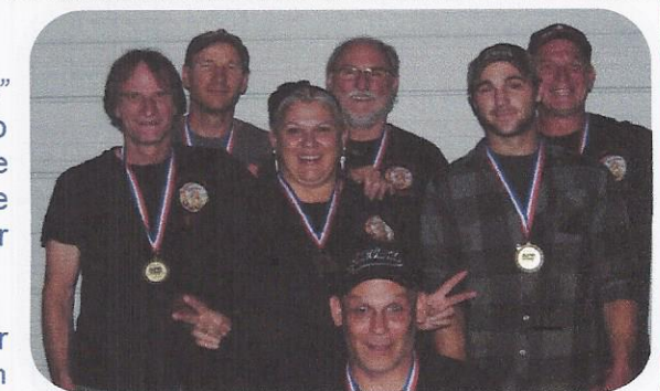
PLATINUM - BEHIND THE 8-BALL