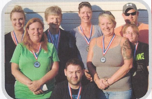
SILVER - THE MISS CUES