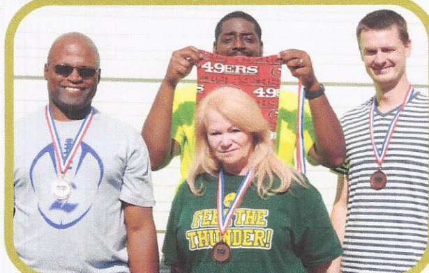
BRONZE -- WORKS FOR US