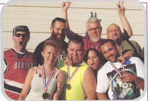
SILVER - MAIN STREET MADNESS

So, in the finals it was "Behind the 8-Ball" from Fortune Star versus everybody's favorite food "A Roast Beef Sammich" from Sam's Hollywood Billiards...One would be Golden and one would be Platinum. Starting with a Color of Money (Continued on Pg 5.)