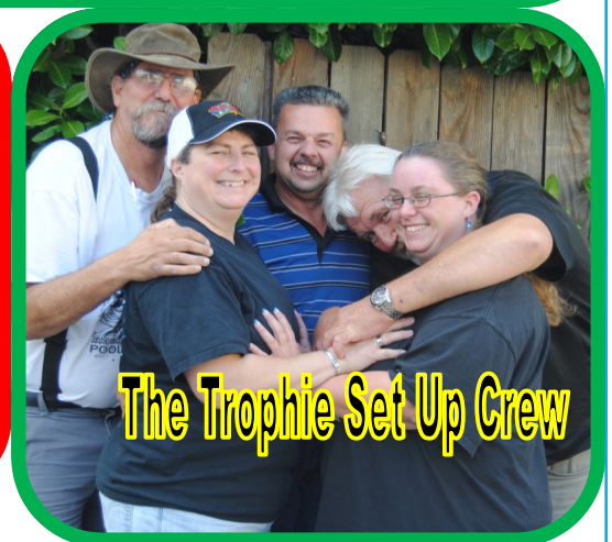
The Trophy Set Up Crew