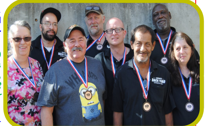
BRONZE -- SWINGING STICKS