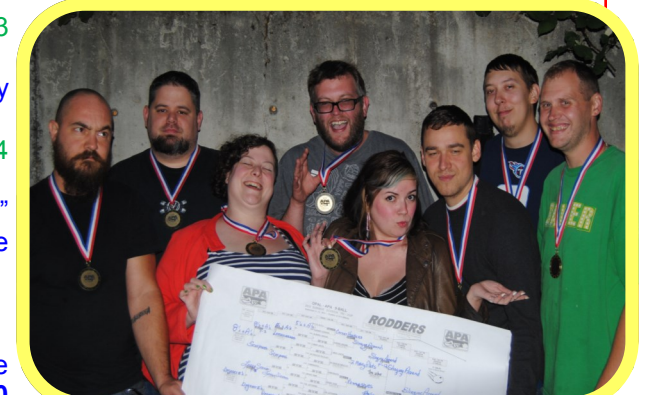
GOLD -- SLINGING AROUND