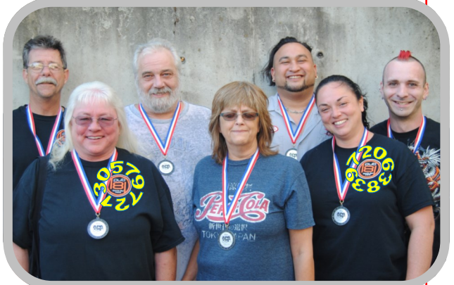
SILVER -- STICKLERZ