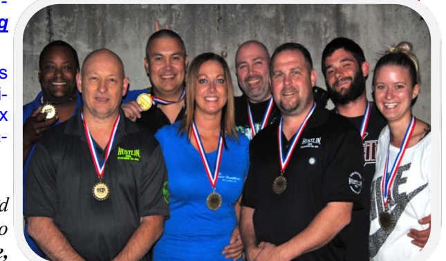
PLATINUM -- 8'S & A'S