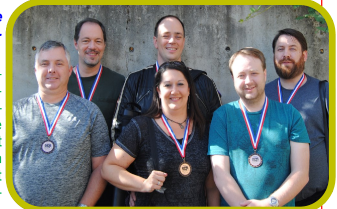
BRONZE -- WHY SO HARD?