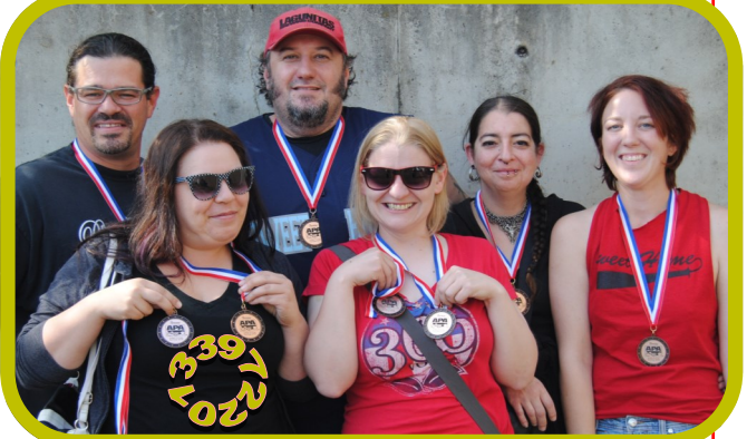
BRONZE -- STICKS LIKE JESUS