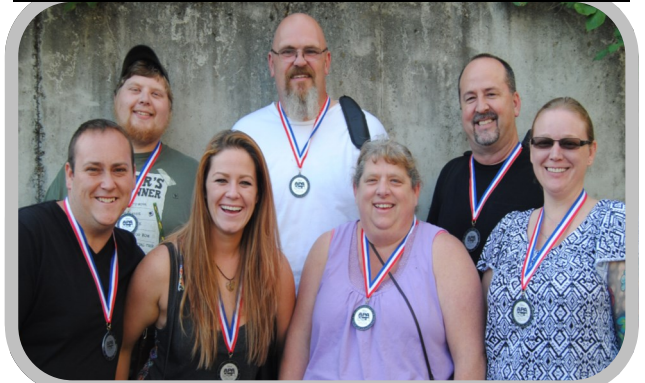
SILVER -- WATERLOGGED