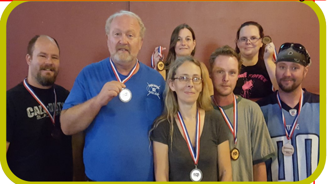
BRONZE -- CORNER HOOKERS

" Slinging Around " ended up taking the shorter undefeated route to get to the finals whereas. " 8 's & A 's " journey—took them all the way through the loser's side from the geit-go, and then back around through the winner's side to the finals. " 8's & A 's " played with a lot of heart and often just barely escaped out of the clutches of their opponents on their egg shell stepping journey. At Rodders on Friday night "8's & A's" got delayed by the Coney Island "Corner Hookers" who would go on to be eventual Bronze medal winner's. Arriving back at 1 PM Saturday (Continued on Page 3.)