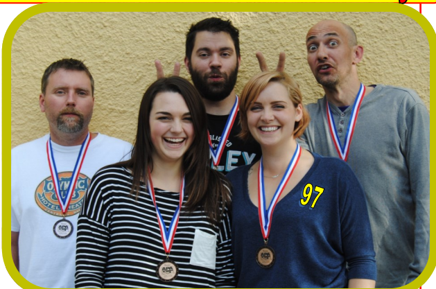
BRONZE -- BREAKING CUES

It was almost a mirror image journey to the finals for both "Under8ted," and "Nice Rack" . "Under8ted" started out at Rodders with a Friday Night "Bye" in slot 27. Saturday morning they were sent foolishly flying to the loser's side by the "Grade 'A' Fools. There in the Sat. 1 PM Round they ended the journey for "Sanchos" and then out tricked the "Trick Shots" in the 5 PM round sending them permanently out the door. With that win, "Under8ted" gained passage back across the board to the 9 AM Sunday round where they would face off "Fear This" in what is known as the dreaded bridesmaid round—The winner would go on to be guaranteed of a medal and a spot in the regionals whereas the loser went home with only a little money "Under8ted" prevailed over "Fear This" to claim both a medal and a spot in the Regionals. "Fear This" disappeared out (Continued on Pg 3.)