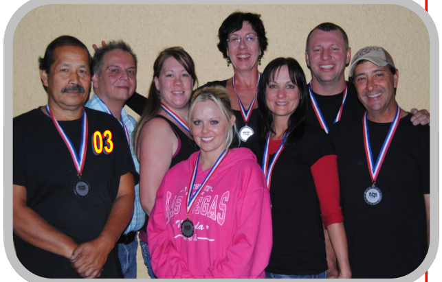
SILVER -- RAWHIDE