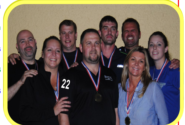
GOLD -- UNDER8TED