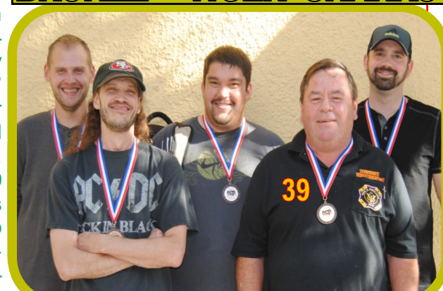
BRONZE -- WATCH OUR BALLS DROP