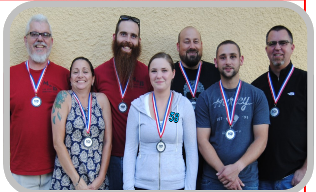
SILVER -- MAIN ST. MADNESS