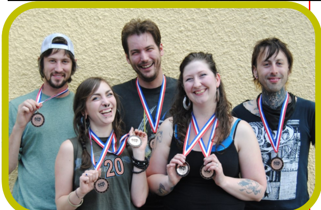
BRONZE -- TIGER SHARKS