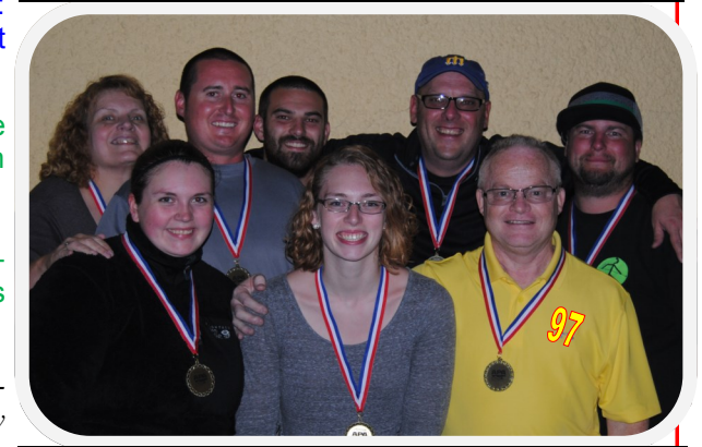
PLATINUM -- NICE RACK