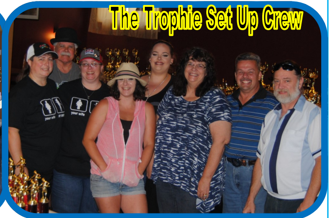
The Trophie Set Up Crew