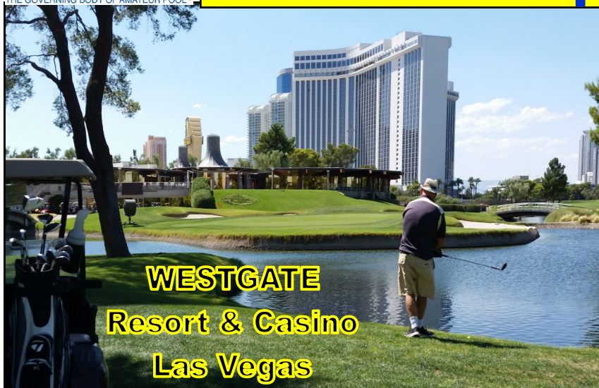
WESTGATE Resort & Casino Las Vegas