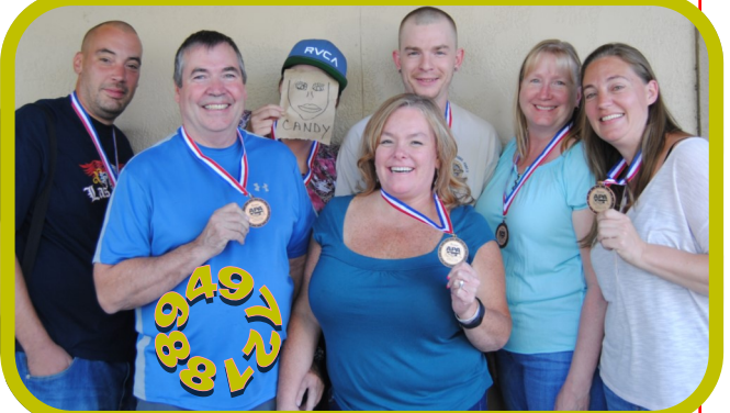
BRONZE -- KISS KISS

Sunday morning started as a battle of the " Why's "—"Why So Hard ?" vrs " Why So Serious ? " (Continued on Pg 3.)