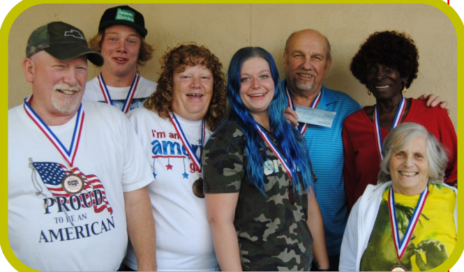
BRONZE -- MOUSETRAP