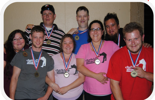
PLATINUM - CHALKING SMACK