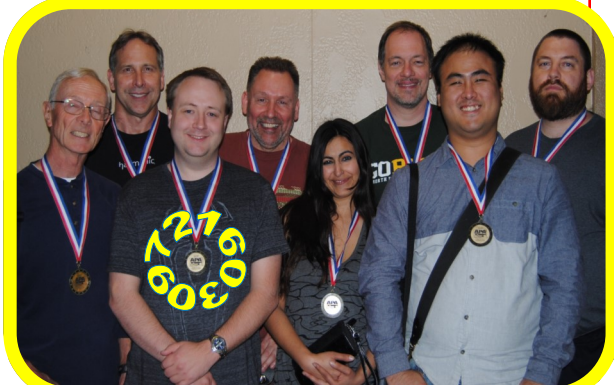
GOLD - WHY SO HARD ?