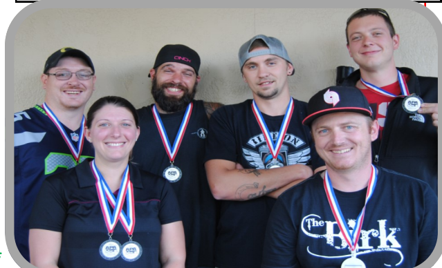
SILVER - POCKET POUNDERS