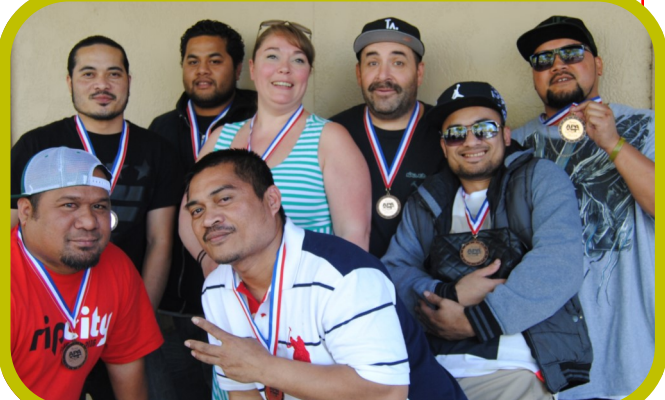
BRONZE -- SCRATCH MASTERS