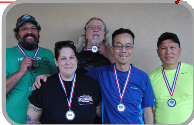
SILVER - CITY HUNTERS