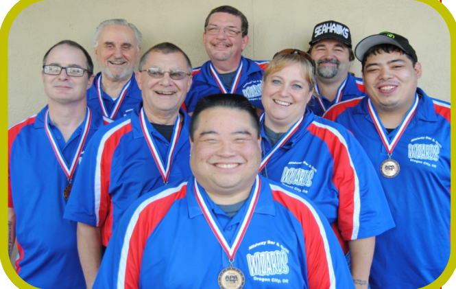
BRONZE -- POOL BALL WIZARDS