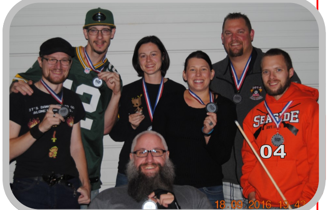
SILVER -- WAIT FOR IT