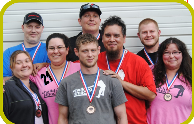
BRONZE -- CHALKING SMACK