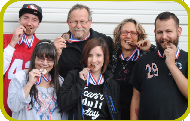
BRONZE -- RACK ON