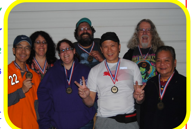
GOLD -- CITY HUNTERS