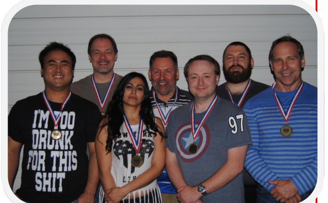
PLATINUM -- WHY SO HARD?