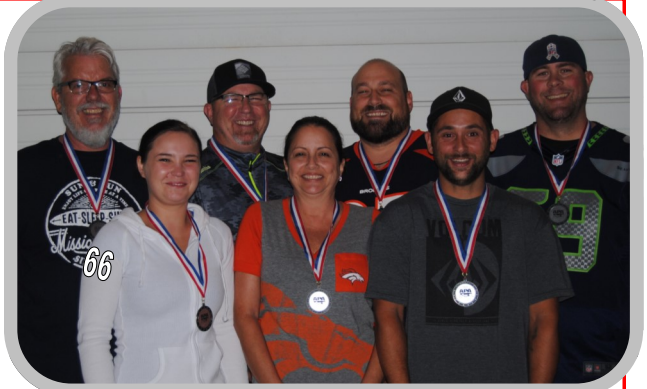
SILVER -- MAIN ST. MADNESS