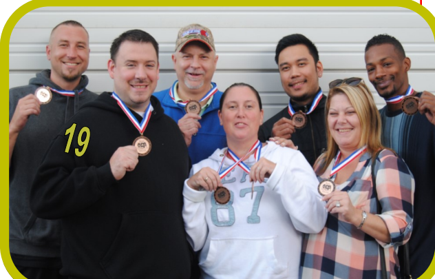
BRONZE -- SECRET SOCIETY PUB 181