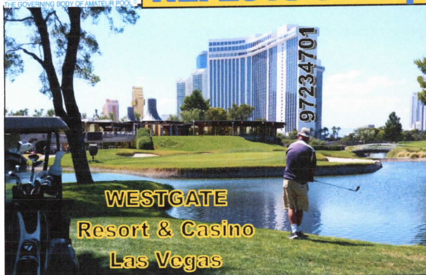
WESTGATE Resort & Casino Las Vegas