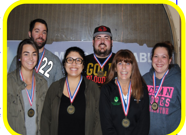
GOLD -- SHOT 4 SHOT