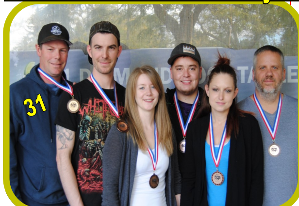
BRONZE -- WE'RE TOO OLD FOR THIS