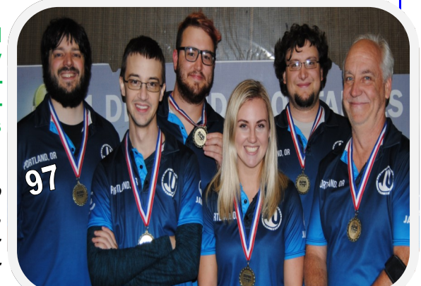
PLATINUM -- BIGGELBACH's