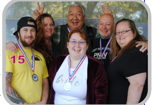
SILVER -- THE TROLLS