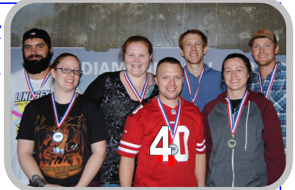
SILVER -- GO FOR IT