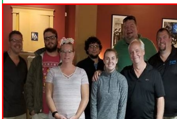
RUNNER UPS: THE BORG