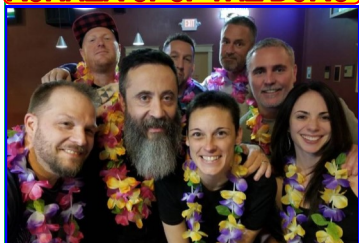
CHAMPIONS: HIGH ACTION