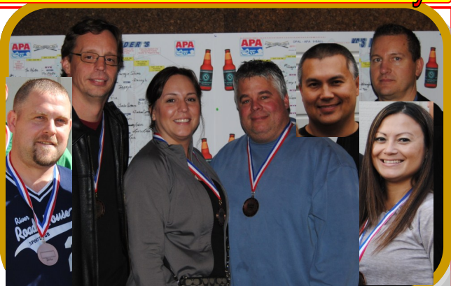
BRONZE -- 8 's & A 's

FINISHING 9-16 and winning $475 was: Homestead's "Swingin' Sticks." Mid Valley Division's "Slingshots"; Falco's "Secret Sopciety;" Sam's "T.M.H.W.;" Rococo's "Skellys;" Nite Hawk's "Ball Breakers;" Dodge City's "Will Play for Tips;" and Irish-town's "The Meat Loop."