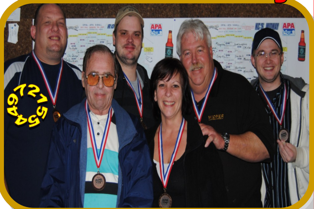
BRONZE -- The Wranglers Too