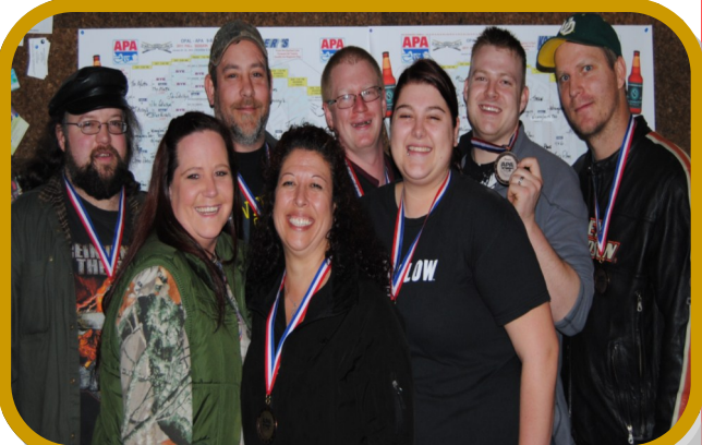
BRONZE -- Dennys