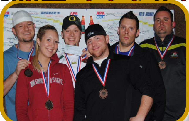
BRONZE -- Billiard Ballers