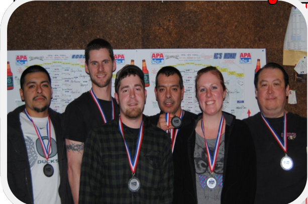
SILVER -- Leo's Lair