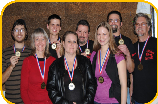
GOLD -- Timber Cutters