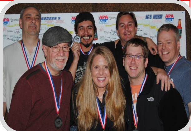
SILVER - Dr. No & The Mulligans