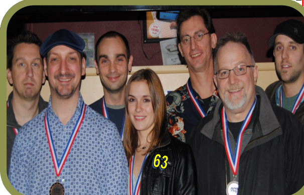
BRONZE -- The Slopshots