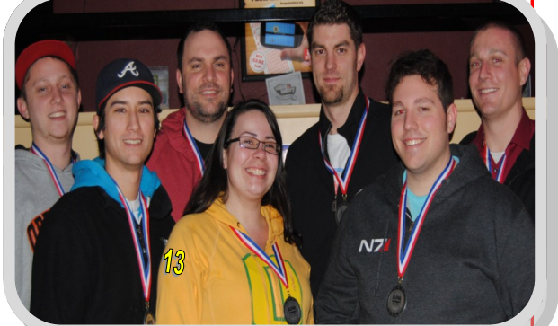
SILVER -- For The Win