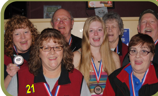
BRONZE -- The Mousetrap