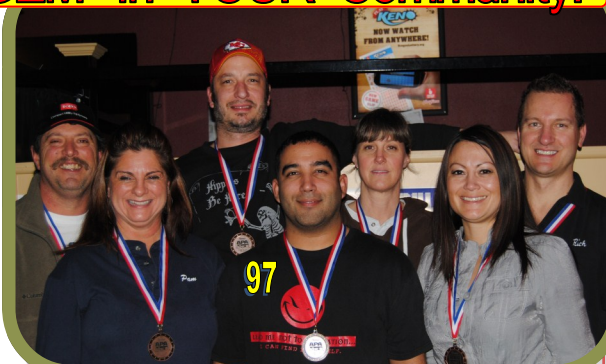
BRONZE -- Jo's Gladiators

"Who's Left?'s" journey to the finals was all the way straight forward and undefeated, but certainly not without peril, nor certainly without panic and underwear changes either. They started out at the Rodders on Friday Night by smoking "Maui Wowie" and exhaling them to the one loss side. Then, the next morning they blew up the boat and marooned the "Cony Islanders" forcing them to jump in and swim over in the one loss side as well. At this point, although still in the winner's side the format changed to Single Elimination—Lose now, and it'd be out the door and down the road. In the late afternoon 5 o'clock round they knocked the fire out of the "Fireballs," and now they (Continued on Pg. 3.)