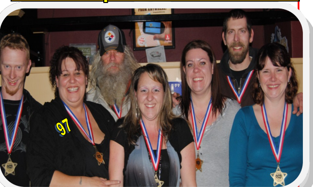
PLATINUM -- Who's Left?