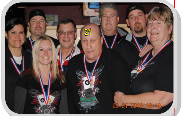
SILVER -- 8 / 9 Suited