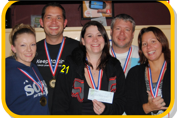
GOLD -- Spicier Pickled Tacos