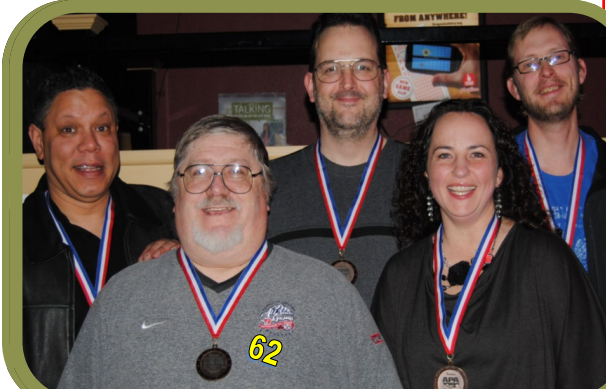
BRONZE -- W.G.A.S.A.