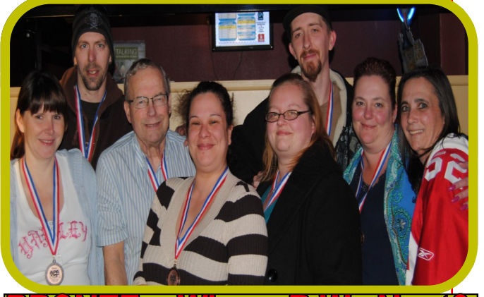
BRONZE - Where R We Next?