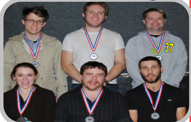
SILVER -- Underachievers