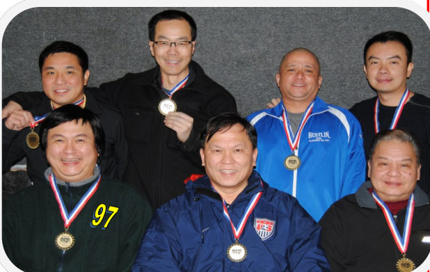
PLATINUM -- City Hunters