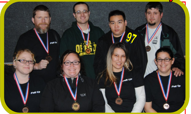
BRONZE -- Felt Up

The 5 PM Saturday round found the B-Bird's up against River Road House's "Secret Society #1." After (Continued on Pg. 3.)