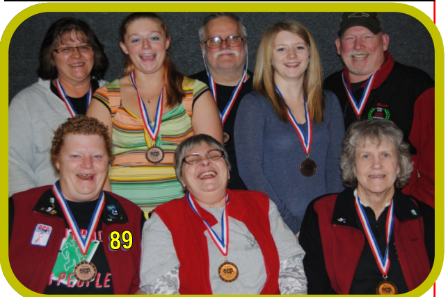
BRONZE -- Powershots