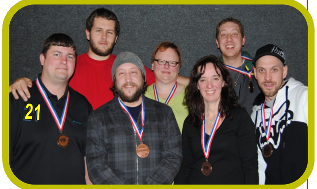
BRONZE -- Hot Rods & Nice Racks