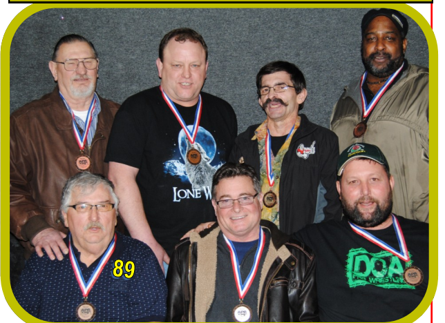
BRONZE -- Moose Rack Pack