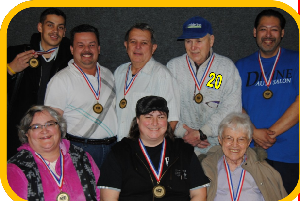
GOLD -- Blackbird