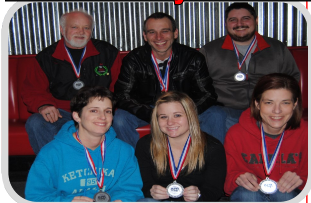
SILVER -- No Drama