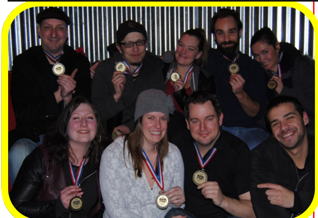
GOLD -- Gut Shot