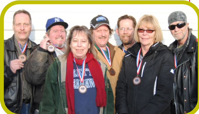
BRONZE -- Chalk Is Cheap