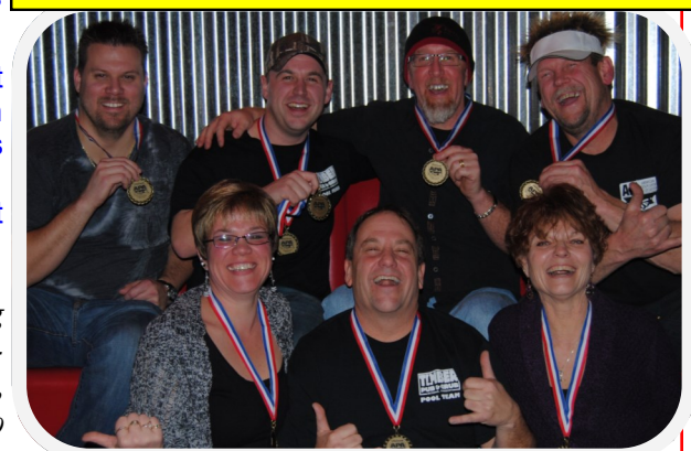
PLATINUM -- Shot Effect