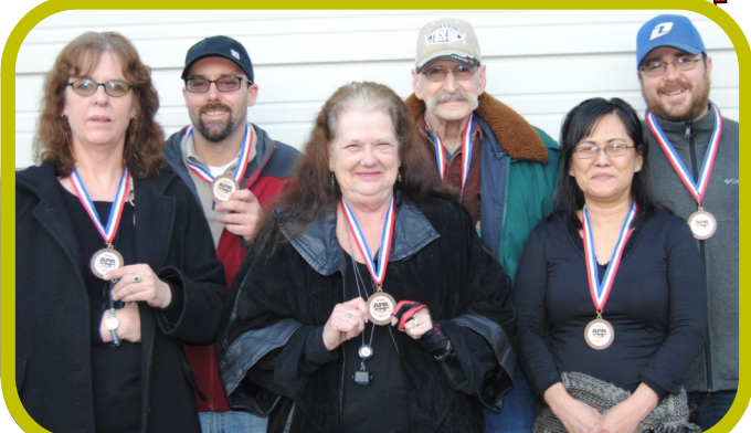
BRONZE -- Cliff's Tavern