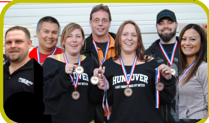
BRONZE -- 8's & A's

"Shot Effect" was now going to Sunday's 9 AM Medal match against "Body English." In a down to the last rack double hill match "The Effect" through a tea party and dumped "The English" in the harbor leaving them behind with $500 and the door while "The Shots" secured a Medal (Continued on Page 3.)