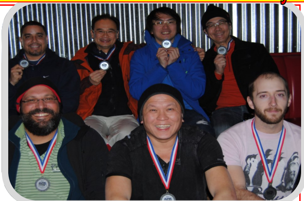
SILVER -- City Hunters