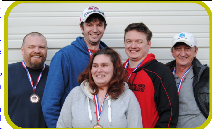
BRONZE -- Time Out For Hugs