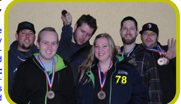
BRONZE -- CHALK IS CHEAP