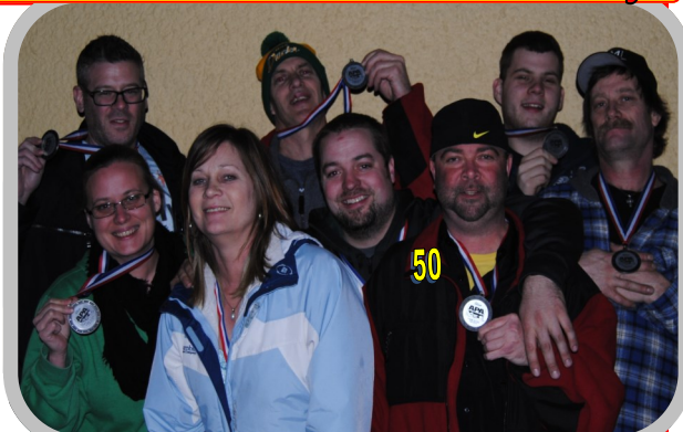
SILVER -- BUSTIN LOOSE