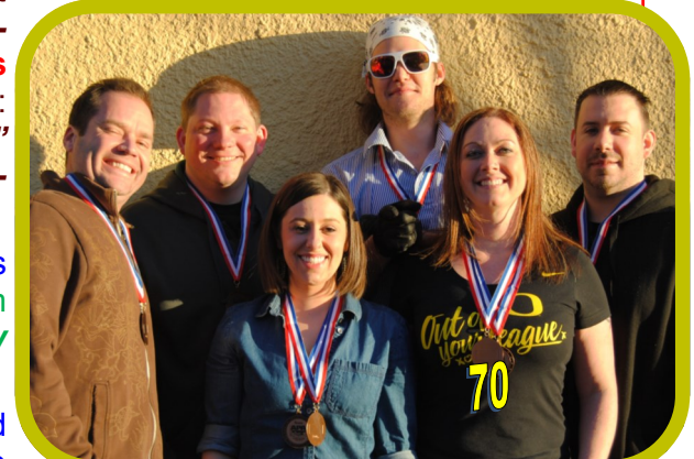
BRONZE -- BROKE AGAIN