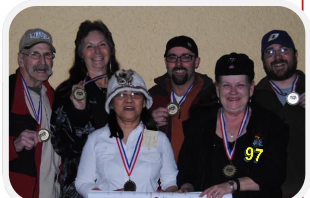
PLATINUM -- CLIFF'S TAVERN