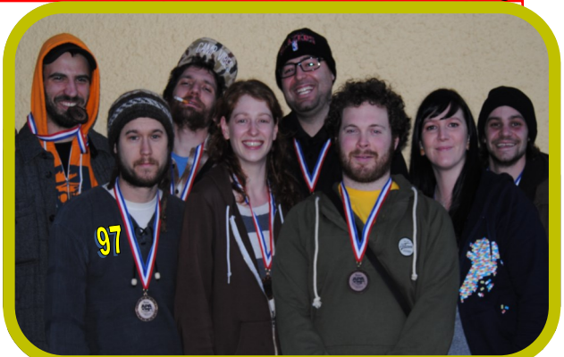
BRONZE -- ROAST BEEF SAMMICH

For both " City Hunters " and " Cliff's Tavern " the journey to the finals was straight ahead and miraculously undefeated, but certainly was not without anxious moments as each of them just barely escaped several double hill matches along the way. " Cliff's " started out at the Midway on Friday Night by clubbing " Cobras & Gentlemen " and sending them to the one loss side. Then, Saturday morning they redirected the " Replacements " to the one loss side as well. Now, in the single elimination 5 PM round " Cliff's " showed " Shooting with Dad: " the way out the door to home and thereby moved on to the Sunday AM Bridesmaid/Medal (Continued Pg. 3.)