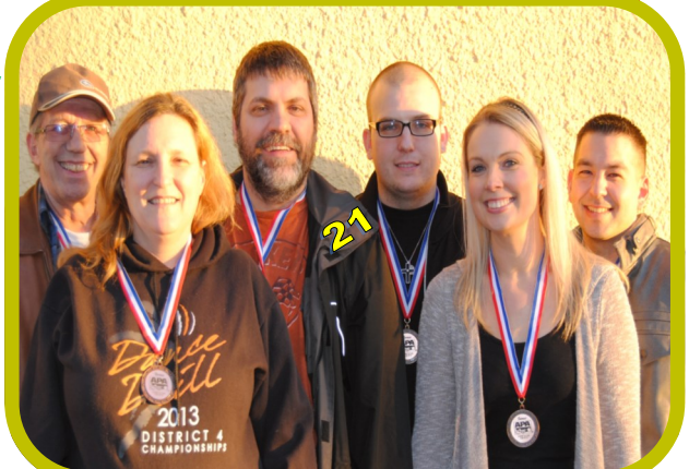
BRONZE -- BOOGITY BOOGITY