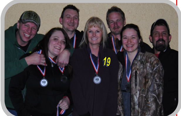
SILVER -- RAWHIDE