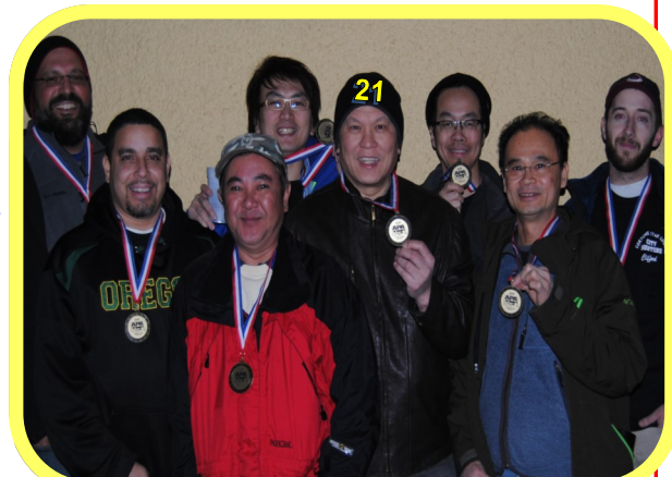
GOLD -- CITY HUNTERS