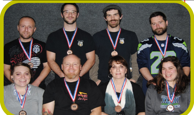
BRONZE -- Cheap Dates