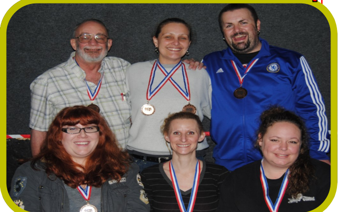
BRONZE -- The Who ?