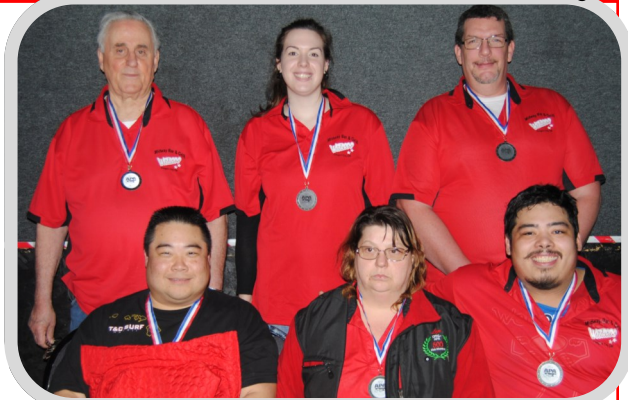
SILVER - Pool Ball Wizards