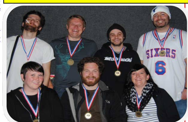
PLATINUM - A Roast Beef Sammich