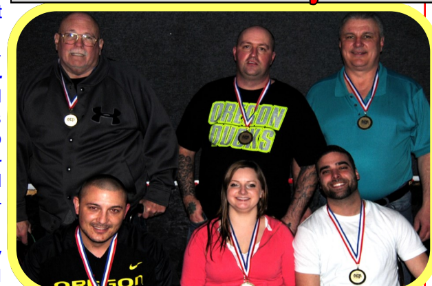
GOLD - Under Pressure