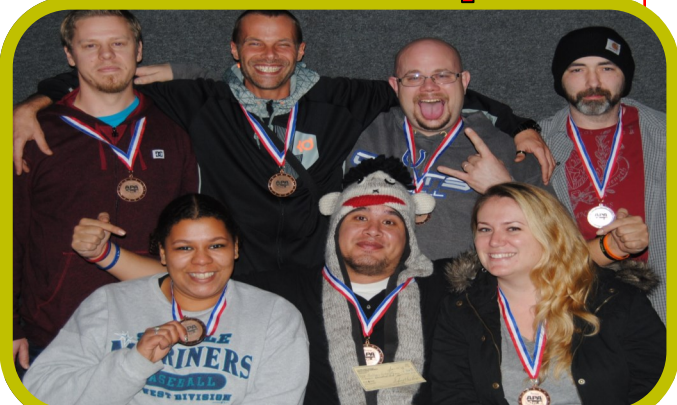
BRONZE -- Ladies & The Tramps