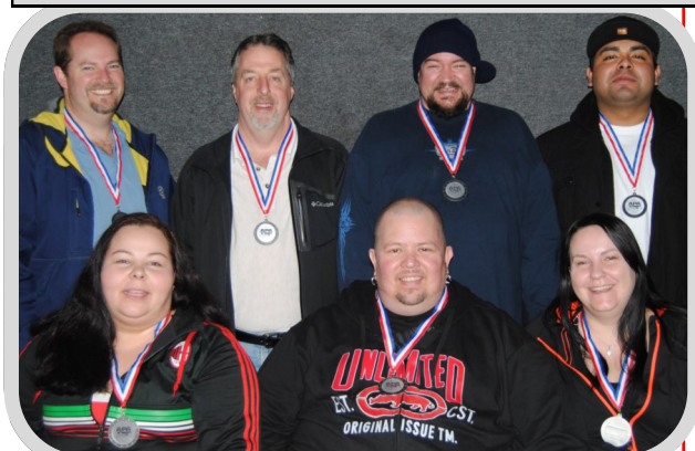
SILVER - Secret Society-Rodders