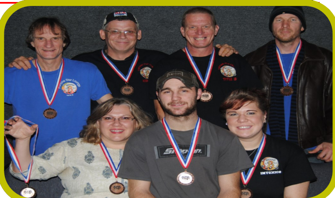
BRONZE -- Behind The 8-Ball