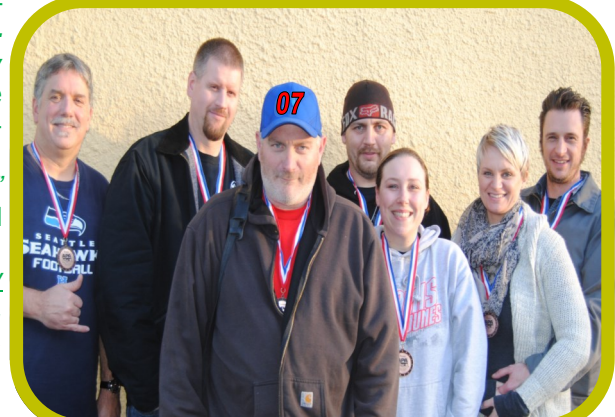
BRONZE -- HONEY BADGERS