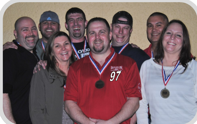
PLATINUM -- UNDER8TED