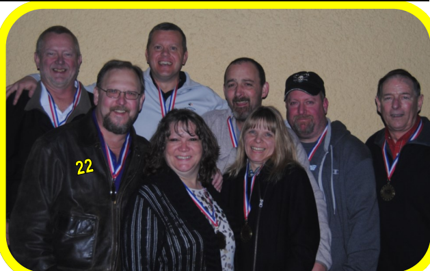
GOLD -- BUGGER OFF