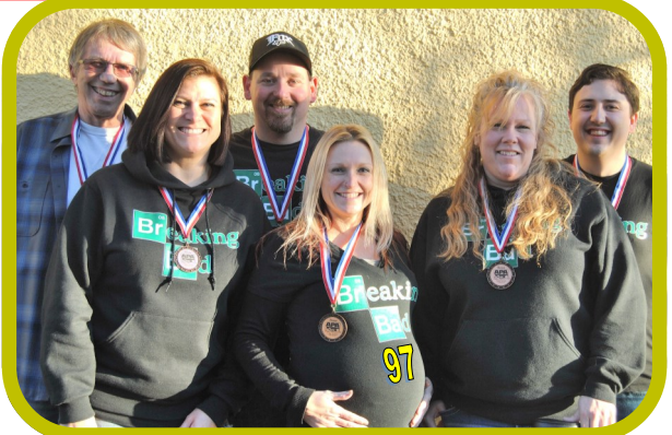
BRONZE -- BREAKING BAD