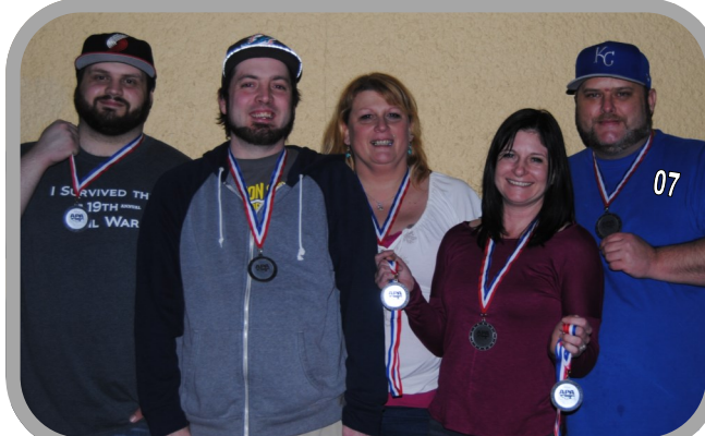
SILVER -- THAT'S OUR CUE