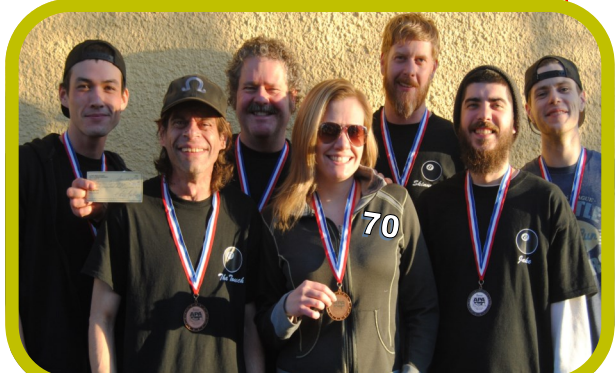
BRONZE -- STRAY CATS