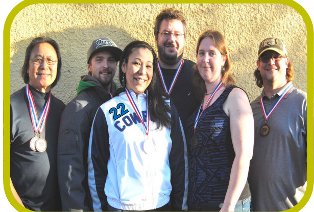
BRONZE -- DRUNKEN MONKEYS