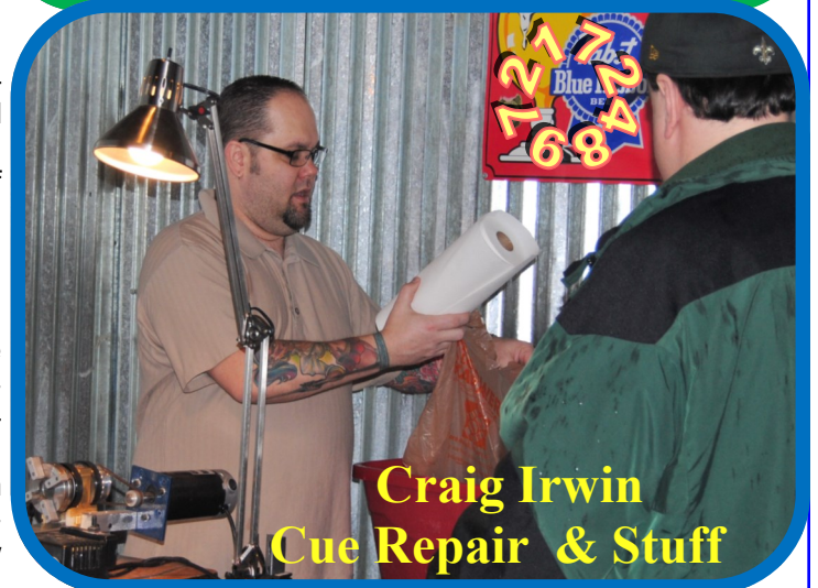
Craig Irwin Cue Repair & Stuff