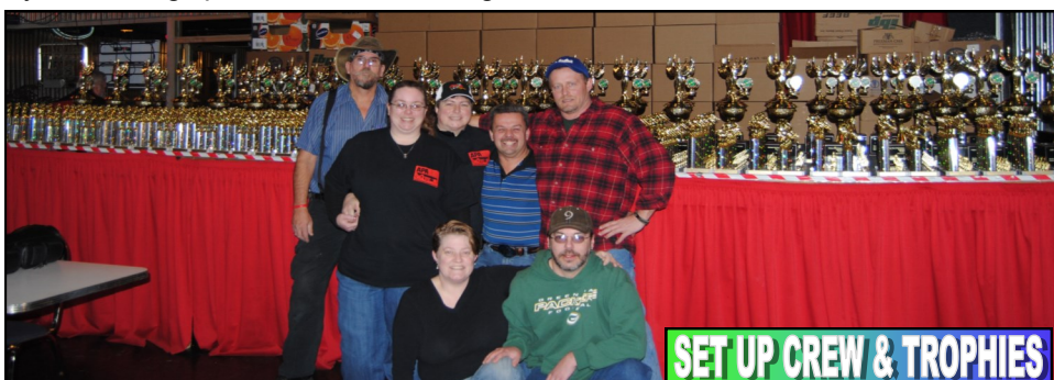
SET UP CREW & TROPHIES