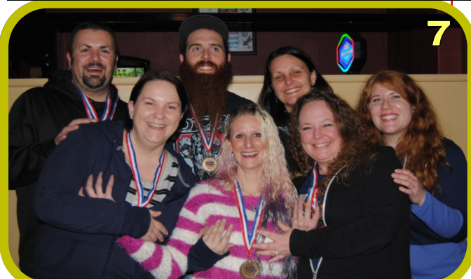
BRONZE -- Little Monsters