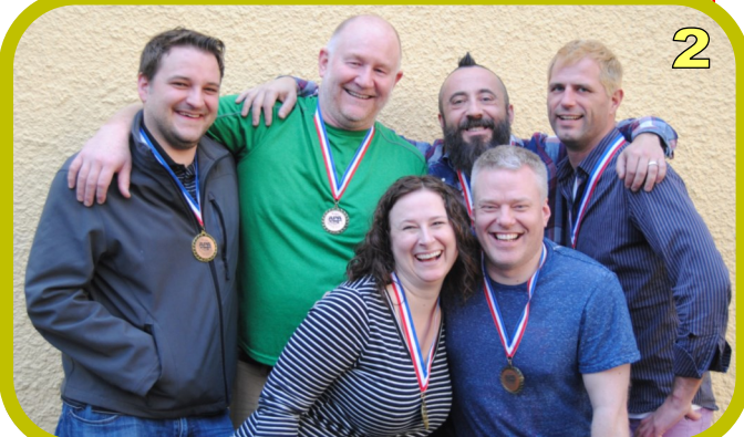
BRONZE -- The Hit Squad