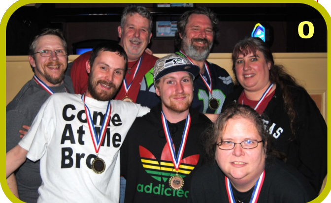
BRONZE -- Yay Beer