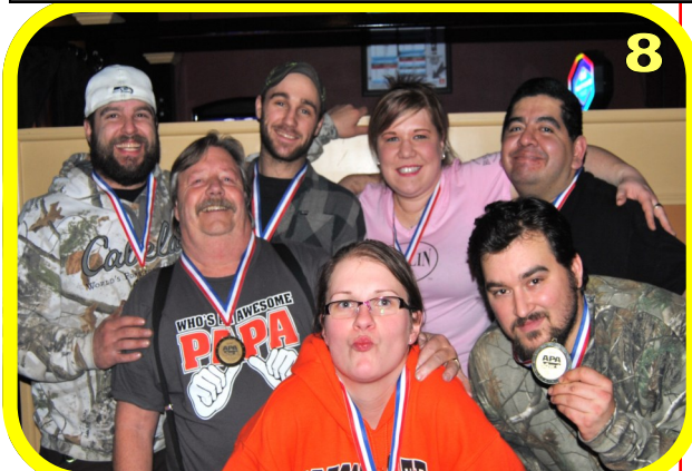
GOLD -- Ridonkulous