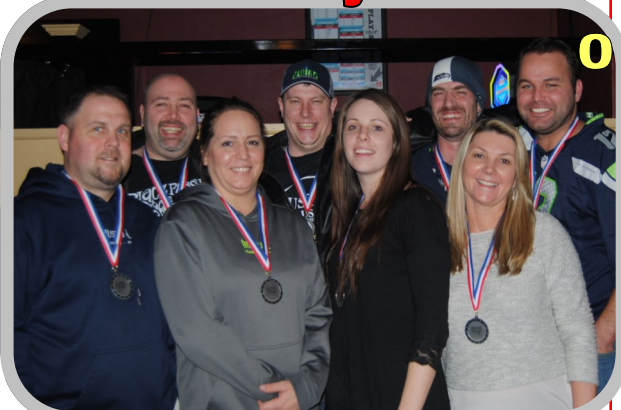
SILVER -- Under8ted