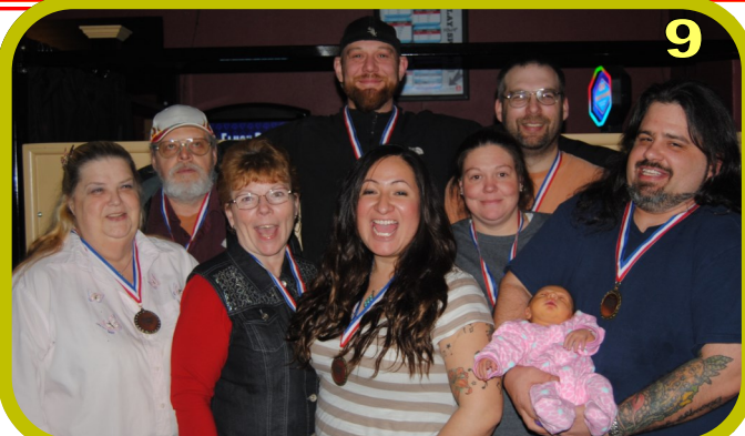
BRONZE -- Just The Tip