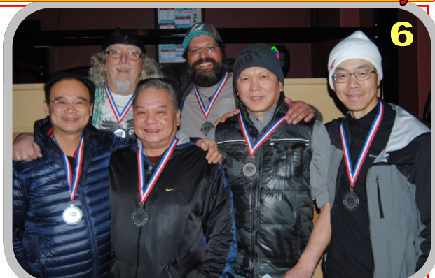
SILVER -- City Hunters