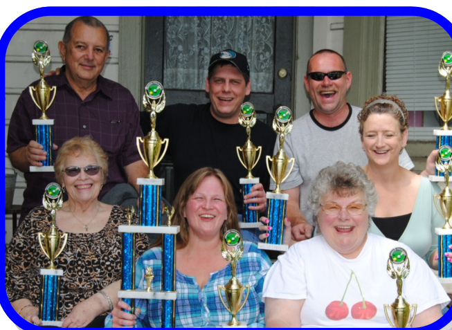
#5 of 6: BEYOND THE INFLUENCE

Next, on two tables simultaneously, "Beyond The Influence" took on the Fall "Rite Of Succession" team of Irishtown's "Meat Loop" from the River City-APA division in the final round of the day where the winner would be hopping on the plane to Las Vegas but the loser would be going home with $500 in their pockets to help them ease their despair. When the dust settled, the total, and final score, after the completion of just four match races was already 54-26--the Contest was over and the "The Meat Loop" was given the consolation check of $500 and the "Miraculously" fortunate team of "Beyond The Influence" was faced with the unusual reality that THEY were going to Las Vegas to compete in the 9-Ball National Team Championships. Both shocked and Giddy "Beyond the Influence" staggered outside to get their pictures taken with their brand new shiny regional win trophies.