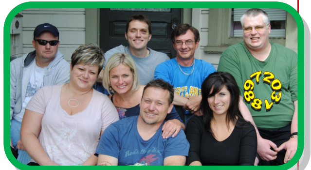
Consolation: The Meat Loop