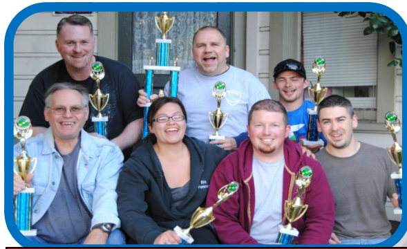
#1 of 6: JAKE 'S CRUSADERS