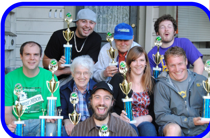
#3 of 6: THE RAVENS

We strongly suspect it's all a false protest as she just doesn't want to appear eager to bathe in her teams just glory. However, once she's in place, she's always the most photogenic of them all ! " The Ravens " are going to Las Vegas !