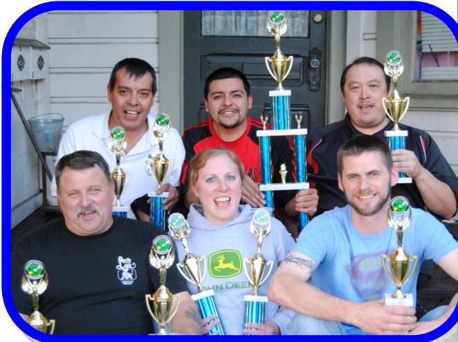
#2 of 6: LEO'S LAIR

score was 51-49 and narrowly defeated " The Meat Loop " was off to the one loss side and " Leo's Lair " was given passage on to the boat to the 5:00 Winner's point final's. In the 5:00 PM finals " Leo's " met the other Spring Session " Rite of Succession " team " The Kiss of Death " from Scotty's in the Skyline Double Jeopardy division. After two very close and nerve wracking contests " Leo's " had barely escaped death twice already, and here they were facing it again. This time though was different—they weren't about to lie down and die, or get kissed anywhere, by anyone, without first having given it their all. So " Leo's " came blasting out of the gate in full battle armor swinging their sticks in deadly precision—not letting up—until " The Kiss of Death " had been shot down in just 4 races 50-30 and sent limping over to the one loss side. With both shock and Glee, " Leo's Lair " herded themselves outside to get their pictures taken with their brand new shiny regional win trophies while pinching themselves to see if in fact they weren't dreaming....They weren't dreaming—They weren't, and they're going to Vegas!