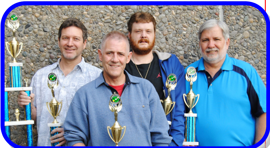
STARHOUSE: "THE COOLERS"

Both victors, Rialto's " Gifted Gorilla's " and the Star-house " Coolers " secured the well deserved team title of Triple Play Master's Champion for 2011—12 with all the bragging rights to go along with it. Each team also received individual trophies and a host location trophy, the top travel and accommodation purse of $1,800 ( $150 was already deducted to hold their slot for the National Championship) leaving them with enough money to adequately cover both airfare and lodging when they go to the Las Vegas National Championships this coming August 2012 at the Riviera Hotel & Casino in Las Vegas Nevada. Our sincerest congratulations to both teams. (Continued Page 3.)