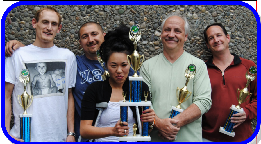
RIALTO'S: GIFTED GORILLAS