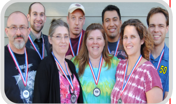
SILVER -- Shark Tank