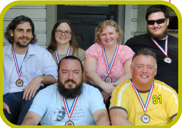
BRONZE -- Tear For The Nest