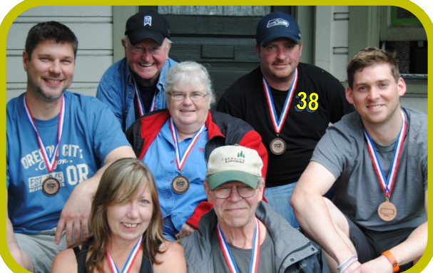
BRONZE -- The Taco Stand