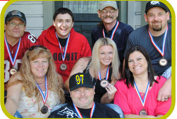
BRONZE -- Breaking Bad

"Free Ballin's" journey to the finals was all the way undefeated, but certainly not a cake walk as they just barely escaped from several double hill matches along the way. They started out at the Midway on Friday Night by cleaning up "Filthy McNasty" and sending them covered in soap suds to the one loss side. Then, Saturday morning they avalanched the "Shamrockers" forcing them over in the one loss side as well. At this point, although still in the winner's side the format changed to Single Elimination—Lose now, and they'd be going out the door and down the road to home. In the late afternoon 5 o'clock round the "Ballin's" out "D'd" "Tenacious D." to move on to (Continued on Pg. 3.)