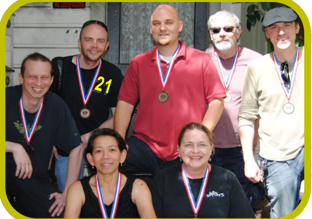
BRONZE -- Slow Your Roll