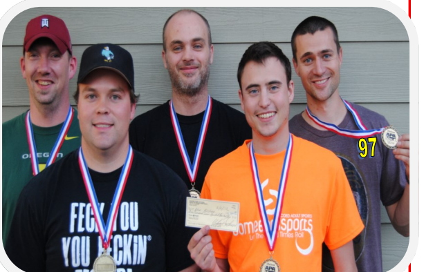
PLATINUM -- Thrown Together