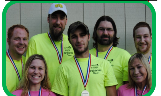
CONSOLATION: QUIT TALKIN' START CHALKIN'