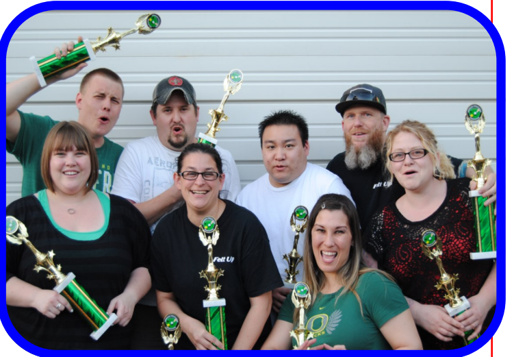
#3 of 6: FELT UP