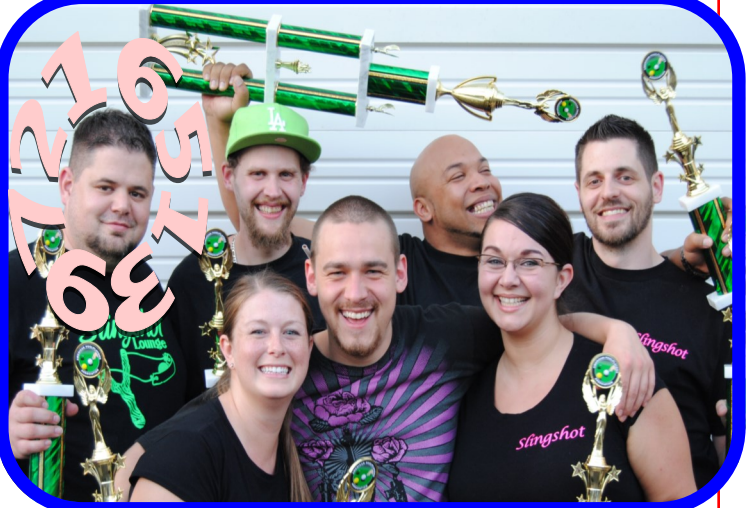
#2 of 6: PRETTY IN PINK

(Continued from Pg. 1) with a "Bye" handed to them on Friday night. So they didn't have to play until Saturday Morning. Next came the Saturday 9:AM round where the " Pink's " had drawn Fall Session's Tri-Cup Gold winners Icabod's " Mis-Q's-9 " from the Skyline D.J. division. When the dust settled the "Mis Q's" were off to the "last freakin' chance side and " Pretty In Pink " was off to the 5 PM Winner's final. In the 5:00 PM finals the " Pink Pretty's " met Fortune Star's Summer Session Silver Medalist's " Quit Talkin' Start Chalkin' " from the Far East D.J. division. Showing they just weren't all eye candy, the " pretty's " came blasting out of the gate in full battle armor swinging their sticks in deadly precision—not letting up—until " Quit Talkin' " had been rendered speechless in just 4 normal match races and only a bit into the 5th race which went into sudden death. The final score was: 68-32. "Quit Talkin'" limped on over to the last chance side. Meanwhile, with both shock and Glee, " Pretty In Pink " herded themselves outside to get their pictures taken with their brand new shiny regional trophies while pinching themselves to see if in fact they weren't dreaming....They weren't dreaming—They weren't, and they're going to Vegas!