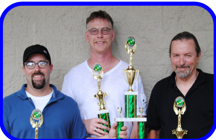
BACK ALLEY: "ALLEY DOGS"

All three teams winning teams to Las Vegas: the Back Alley's "Alley Dogs," River Road house's "Bad Shot Dummies" and the Star-house "Vultures" secured the well deserved team title of Triple Play (Continued on Pg. 3)