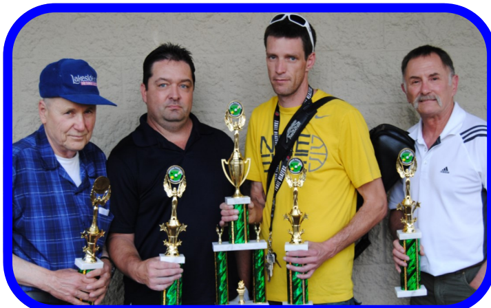
STAR HOUSE "THE VULTURES"