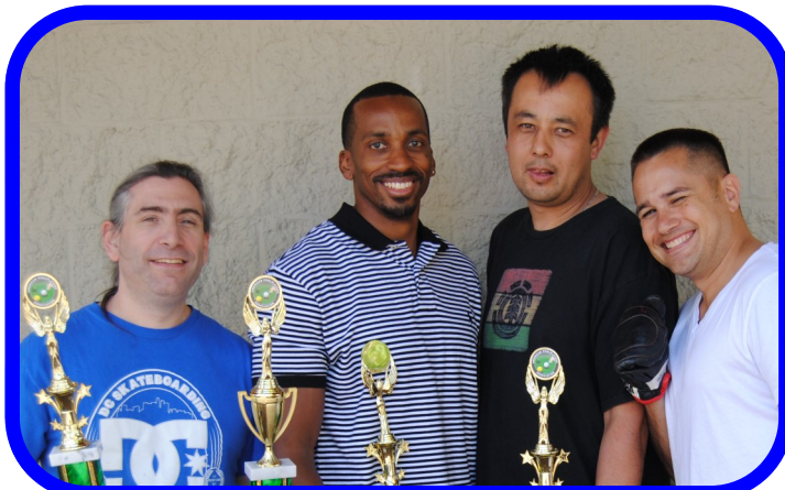
RIVER ROAD HOUSE: "BAD SHOT DUMMIES"