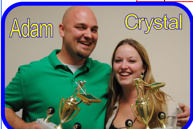
1st: Tempting But Hard