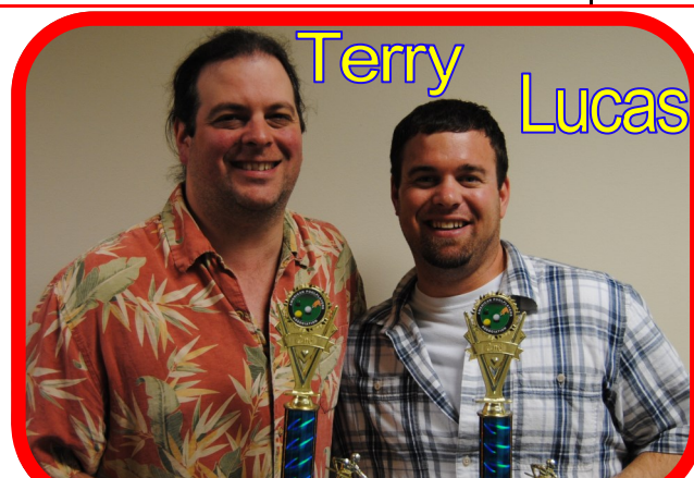
2nd: Pigs Might Fly