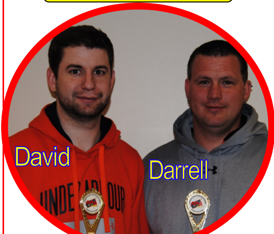
2nd: Twisted Cue Club