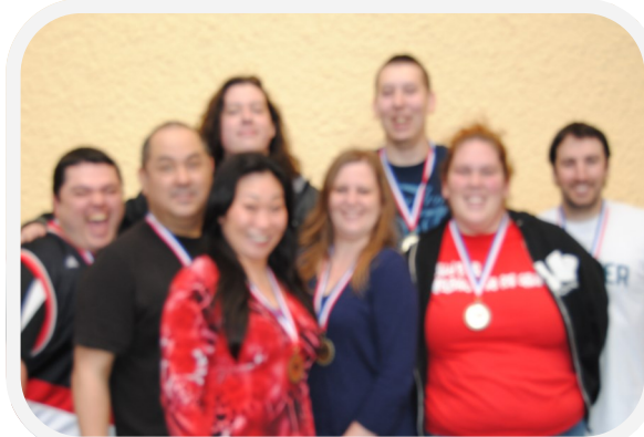
PLATINUM -- NOT LEAGUE MATERIAL

Whoever came up with the team name " Not League Material " certainly came up with a clever oxymoron because their journey was short—straight away—undefeated all the way to the finals. The " Notes " began at the Midway on Friday night by breaking the ice —literally—in great big little pieces—against their opponents " The Ice Breakers " sending them to Saturday's 1 PM round over in the one-loss side. Next in the Saturday 9 AM round they drew a straight— that's straight to the 5 PM round —after beating the 8's and A's hand. Coming back at 5 PM they decided to simply keep it simple and proceeded to just bear down and pummel " Keep It Simple " on out the door to home while the " Notes " received their Sunday 9 AM pass to compete in the bridesmaid / medal round.