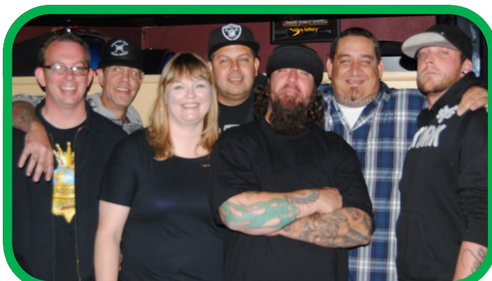
SUCCESSION: 8-Ball Busters