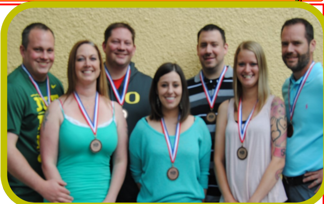
BRONZE -- BROKE AGAIN

FINISHING 33-47th and winning $170 were: Pit Stop's "Chalked 'n Loaded;" Ickabod's "Maybe Next Week;" Gator's "Lemonheads;" Red Fir's "Fir Balls;" Pub 181's "Pub Crawlers;" Wichita Town Pub's "Kiss Kiss;" Fortune Star's "Fugetaboutit;" Timber's "Timber Cutters;" Star House's "Hugh Jazz Ballers;" Jo Saloon's "Stix & Chix;" Sam's "Roast Beef Sammich;" Nite Hawk's "Wild Wranglers;" Ringo's "Scratch 'n Sniff;" River Road House's "8's & A's;" and River Road House's "Balls 'N Hand."