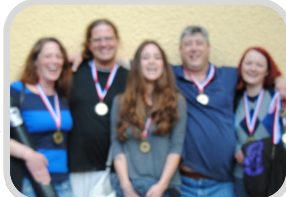
GOLD -- TABULA RASA

" Tabula Rasa " made it a long journey to the finals. They started out Friday night at the Midway in Slot #30 and ended up getting their balls busted by the "8-Ball busters." They didn't play again until 1 PM Saturday where they took command and snatched "Balls In Hand" to the street and home. In the 5 PM round the weren't affected by "Shot Effect" and found themselves moving on to the bridesmaid / medal round on Sunday morning. Against an undefeated "Clean Up Crew" from Mike's Place.