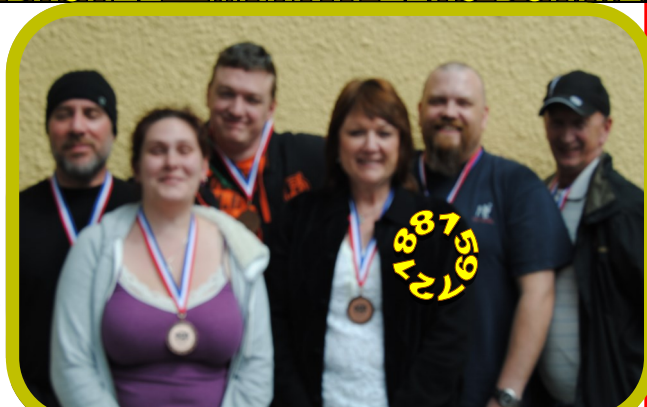
BRONZE -- TIME OUT FOR HUGS