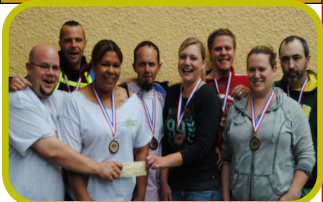
BRONZE -- LADIES & THE TRAMPS

FINISHING 25-32nd and winning $250 was Western 9-Ball Division's "Big Red's;" Timber Pub's "Shot Effect;" Pub 181's "Money Shots;" Ice House's "Ice Breakers;" West Union's "Spicy Pickled Taco's;" Prairie Inn's "Chalk Is Free;" Sundowner's "Nine Hangin'" and River Road House's "Boomer Said No!"