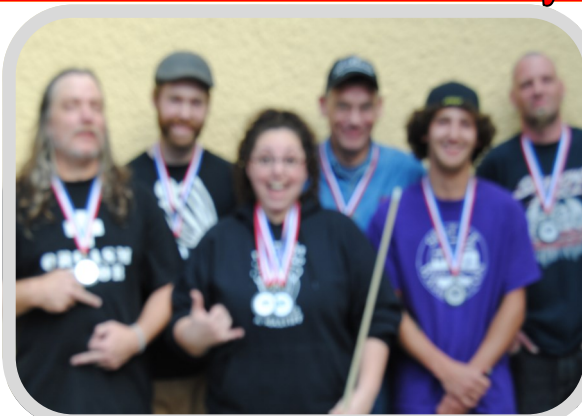
SILVER -- SUPER SHAFT