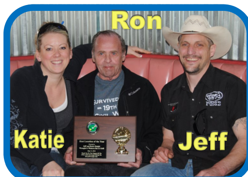
WRANGLERS - Host Location of the Year