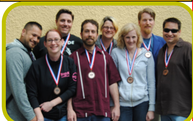
BRONZE -- MARK IT ZERO DONNIE

FINISHING 9-16 and winning $520 was: Sweet Home's "Sticks Like Jesus;" Fortune Star's "Devil's Rejects;" Mike's Place "Clean Up Crew;" Coney Island's "Coney Dawgs;" Falco's "8-Ball-Busters;" Back Alley's "Blackbird;" Wrangler's "Motorboatin';" and Midway's "Diamond In The Rough."