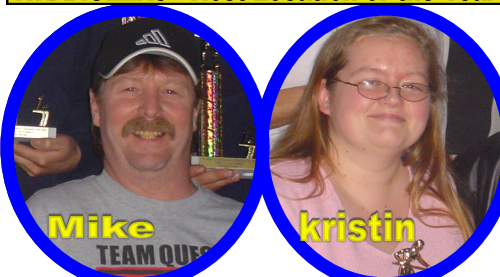
League Members of the Year