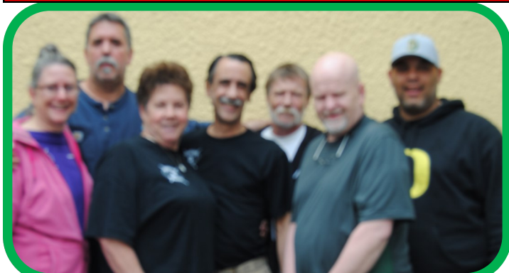
SUCCESSION: Coney Dawg