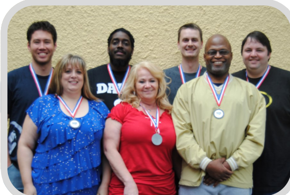
SILVER -- WORKS FOR US