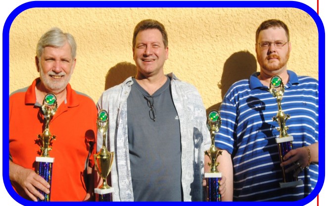
STAR HOUSE - "THE COOLERS"