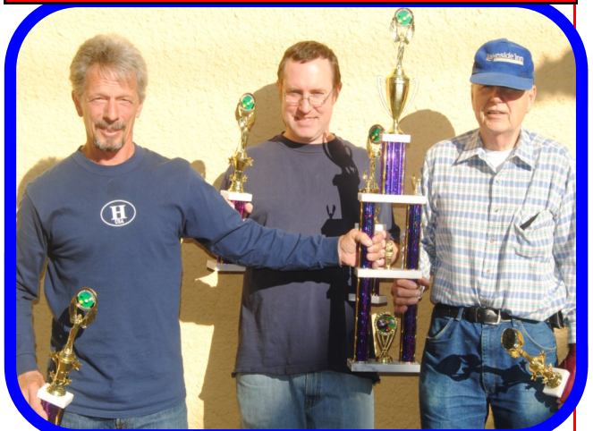
STAR HOUSE - "THE VULTURES"