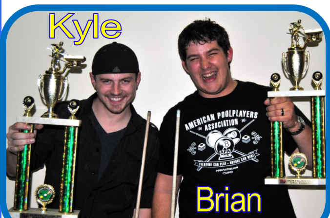
1st: Jeez La Weez