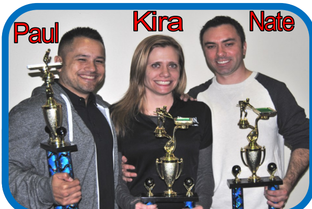
1st: - You've Been Served