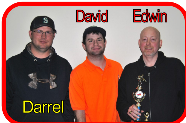
2nd: - Twisted Cue Club