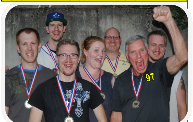
PLATINUM -- SCORPIONS