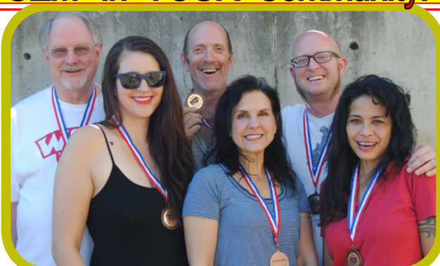
BRONZE -- ANDY'S BAR

Both finalist teams took the shortest journey possible to make the final pairing. Coming from the Southern OPAL border Outback D.J. division Wild Horse's " Pocket Pounders " journey was full of drama. Drawing a Friday night "Bye" at Rodders they started out Saturday morning by sending Coney Island's " Don't have a cue " to the back side. (Continued on Pg. 3.)