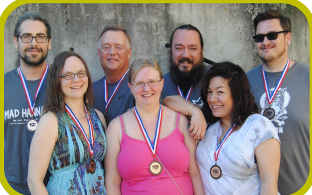
BRONZE -- MAD HAMSTERS