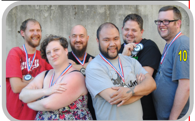
SILVER -- SLINGING AROUND