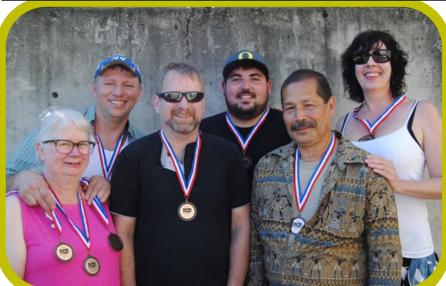
BRONZE -- NO DEALS