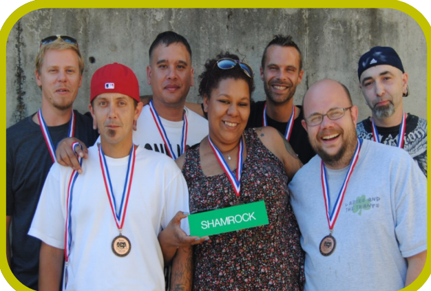
BRONZE -- LADIES & THE TRAMPS