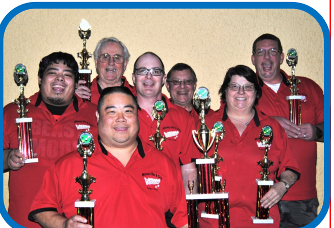
#4 of 6: POOL BALL WIZARDS