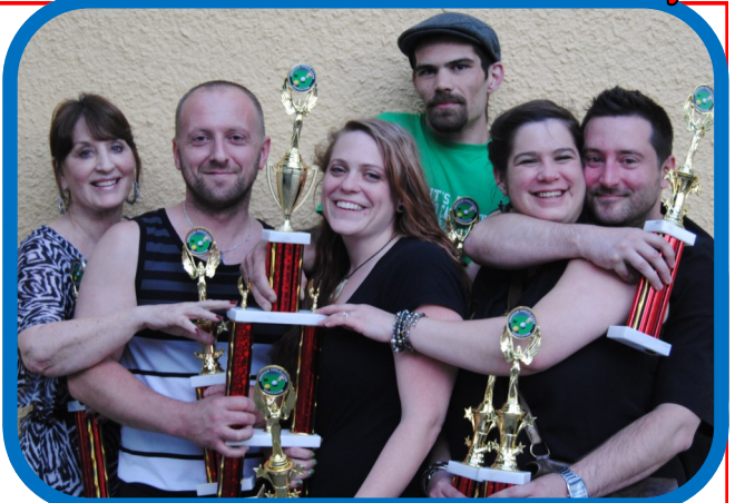
#2 of 6: CHEAP DATES