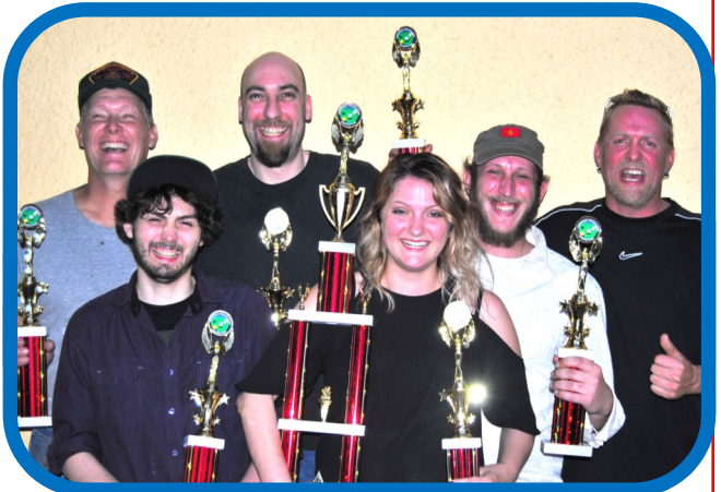
#3 of 6: The - WOLF PACK