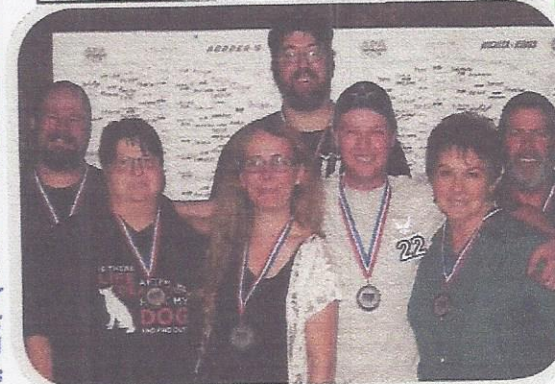
SILVER - WHATEVER'S CLEVER