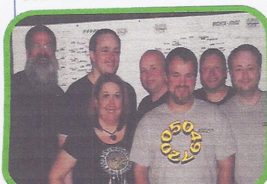
SUCCESSION: Right On Cue

Special Note: Though the Dug Out's "Right On Cue" missed out on winning a medallion, they still earned a spot in Regionals by right of succession. The team that beat them in the Sunday morning medal round - "The Hit Squad" was already regionally qualified from a previous Tri-Cup. Therefore, by the right of succession, (since a team cannot win two regional