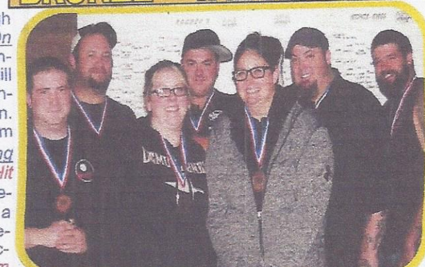
BRONZE -- WHO NEEDS A LOT