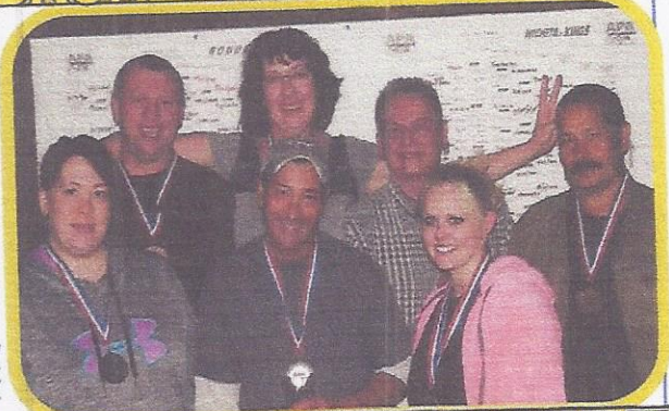
BRONZE -- RAWHIDE