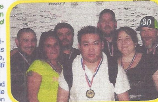
GOLD - THE BANK'S OPEN