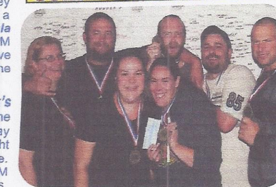
DI ATINI IM - WIDANCI EDC