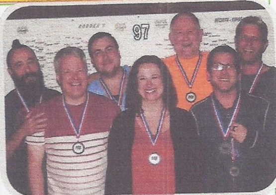
SILVER - THE HIT SQUAD

"Wrangler's" journey to the finals was similar to that of "The Bank's Open." The difference being that "Wrangler's" drew a "Bye" at the Wichita on Friday and didn't have to come in until 9 Am on Saturday where they met up with "Bad Wolf" who chased the cowboy's straight into the One Loss side to face off against their sister team Poke 'N Hope. "Wrangler's" managed to come out ahead and went on to the 5 PM round where they met the "Trouble Makin' Trolls" from Epic Sports. Well "Wrangler's" apparently weren't afraid of a little trouble and gave