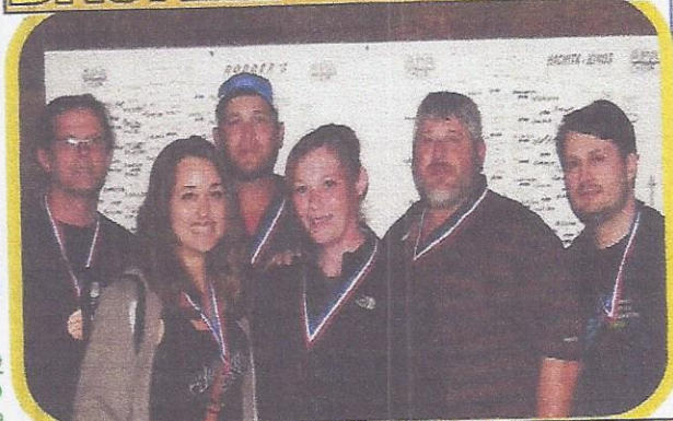
BRONZE -- TABULA RASA