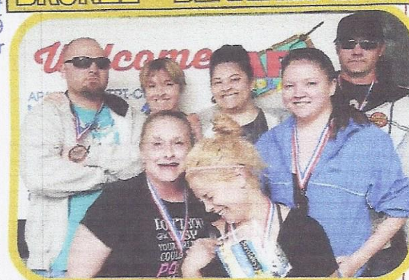
BRONZE -- LOCO OCHO