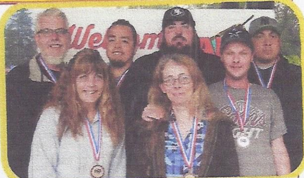
BRONZE -- 2 MANY SHOTS

and just missing a medal, but winning $550 were: Hungry Tiger's "Tiger Sharks," Fortune Star's "Rack 'Em And Weep," Silver Star Saloon's "Land Sharks," Midway's "Pool Ball Wizards," Timber's "Cutters," Yur's "Wild Shots," Silver Star Saloon's "Why So Hard?," and Touch's "Crazy Train."