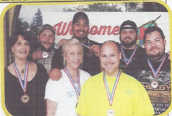
BRONZE -- THE REPLACEMENTS