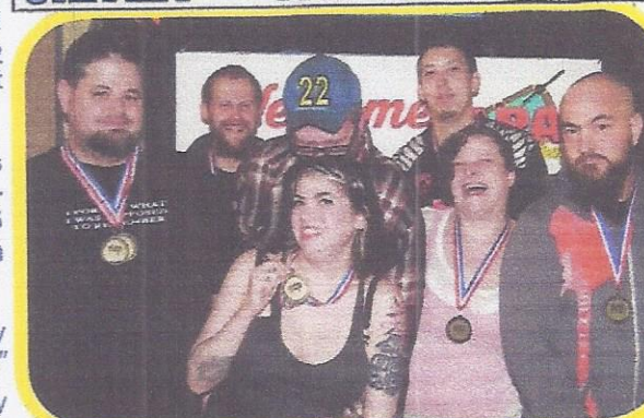
GOLD -- SLINGING AROUND