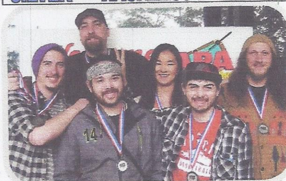
SILVER -- THE WOLF PACK