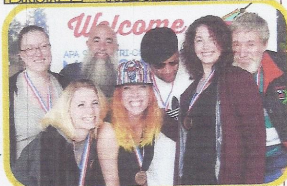
BRONZE -- BEARDIES BACK