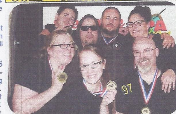
DI ATINIIM POKE AND HOPE