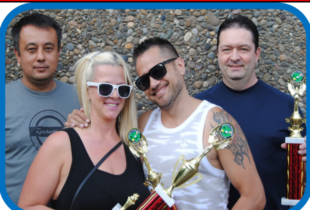
LU's The GOOD SHOT DUMMIES