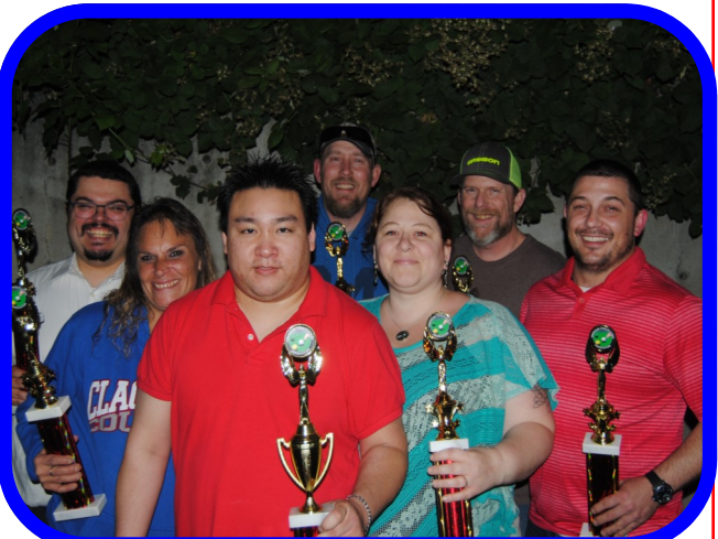
#4 of 6: The BANK's OPEN