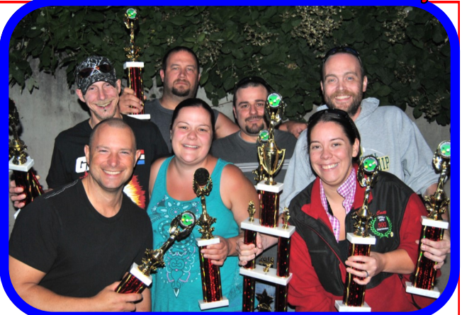
#2 of 6: WRANGLERS