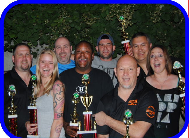
#3 of 6: 8 's & A 's