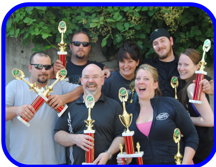
#5 of 6: POKE AND HOPE