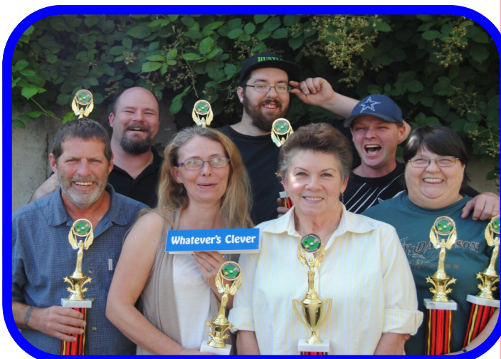
#6 of 6: WHATEVER'S CLEVER