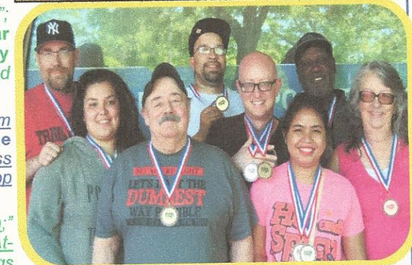
BRONZE -- SWINGIN' STICKS