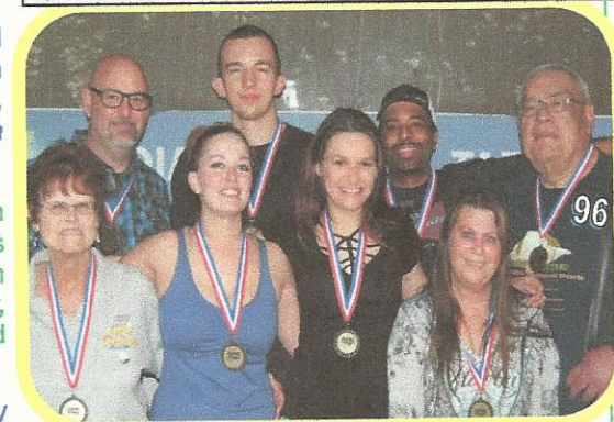
GOLD -- DELINQUENT TENDENCIES