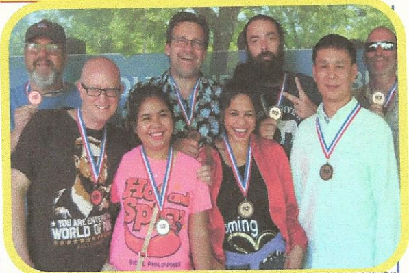
BRONZE -- The NOBODYs