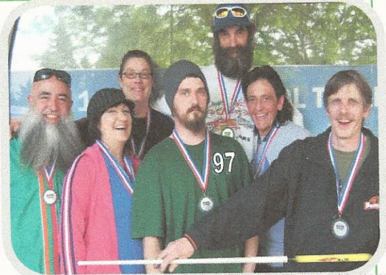
SILVER -- HERE TO HAVE FUN

The " Delinquent's " journey to the finals was almost identical to that of " The Hit Squad. " The " Delinquent's " began Friday night at the Wichita in Slot 25 against " No Shot Sherlock, " The " Delinquent's " shot the " Sherlock's " straight away into the backside. In the (Continued Pg. 4.)