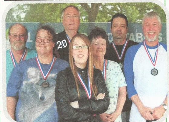
SILVER -- MONEY IN THE BANK