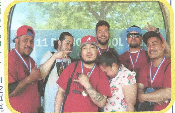
BRONZE -- MICRO 691