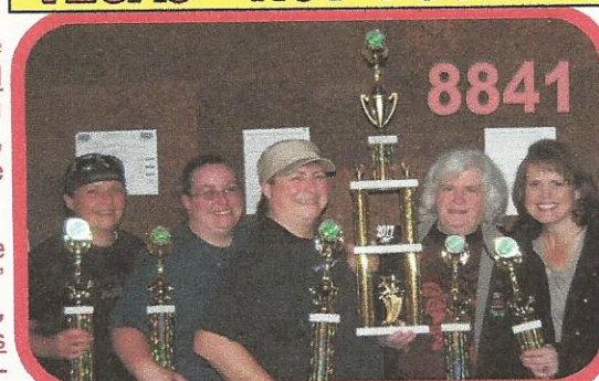
VEGAS -- MONK U UP