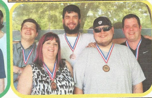
BRONZE -- UNDERGROUND ASSASSAINS