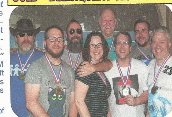
PLATINUM -- The HIT SQUAD