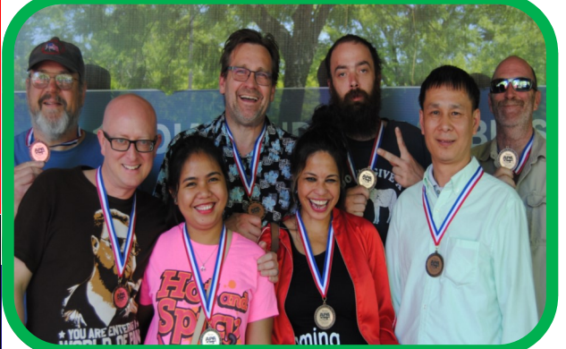
RUNNER-UP: The NOBODY'S