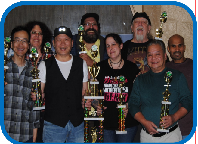
#4 of 6: The CITY HUNTERS