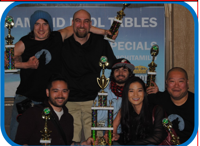
#3 of 6: The WOLF PACK