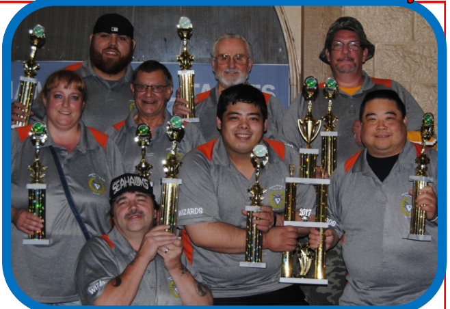
#2 of 6: POOL BALL WIZARDS

The City Hunters had managed to win out over McAnulty & Barry's " Wet & Wild ," knocking them head-first into the "Last Freakin' Chance Side," but the good news was that the wild wets still had a shot at winning one of the last two available $4,500 . (Continued on Page 3.)