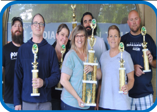
#6 of 6: PROFANITY