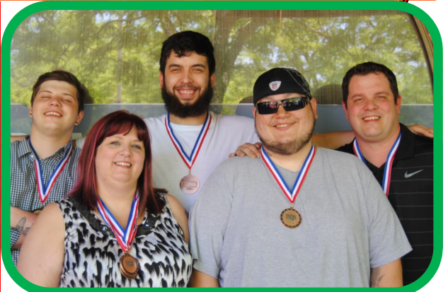
RUNNER-UP: UNDERGROUND ASSASSINS