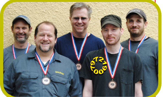
BRONZE -- CHALKED & LOADED