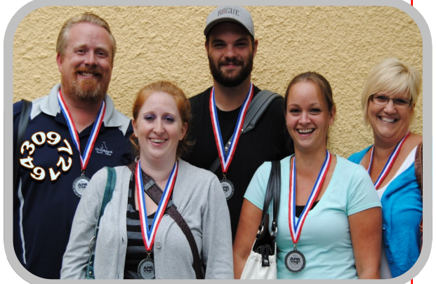
SILVER -- PROFANITY