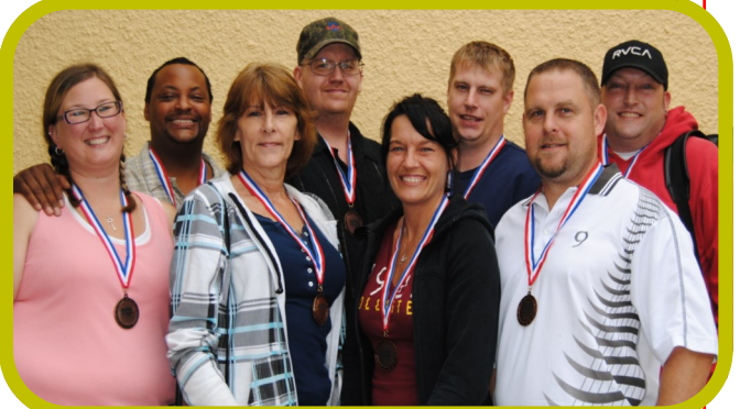
BRONZE -- BALLS-N-HAND

Both teams ended up taking the shorter undefeated route to get to the finals. "Madam's Misfits" played with a lot of heart and often just barely escaped out of the clutches of their opponents on their egg shell stepping journey towards the finals. At KC's Midway "Madam" drew a "Bye" on Friday Night. Arriving Saturday morning they came cooking right out of the gate by making pancakes out of "V.P. Butterballs" 51-9 to advance to the 5 PM round against "Twisted Stixx." "Madam" twisted them right out (Continued on Page 3.)