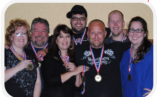
PLATINUM -- MADAM'S MISFITS