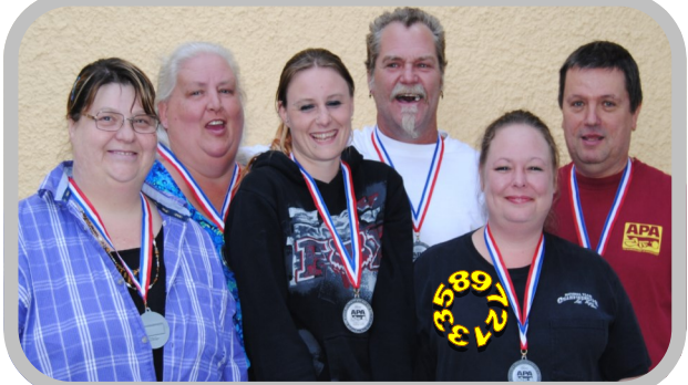
SILVER -- BOOMER'S RINGERS