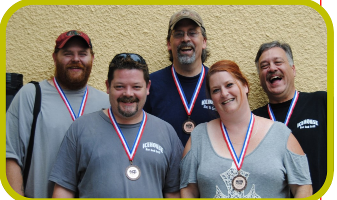
BRONZE -- RIGHT ON CUE